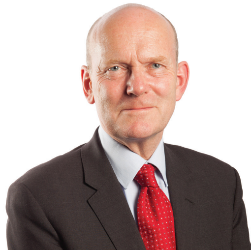
John Biggs Mayor of Tower Hamlets

The people of Tower Hamlets are our greatest asset. My main priorities are to make the council more transparent and accountable and to encourage more local people to get involved in shaping their neighbourhoods, council services and the future of the borough. This Community Engagement Framework, and the Transparency Protocol I