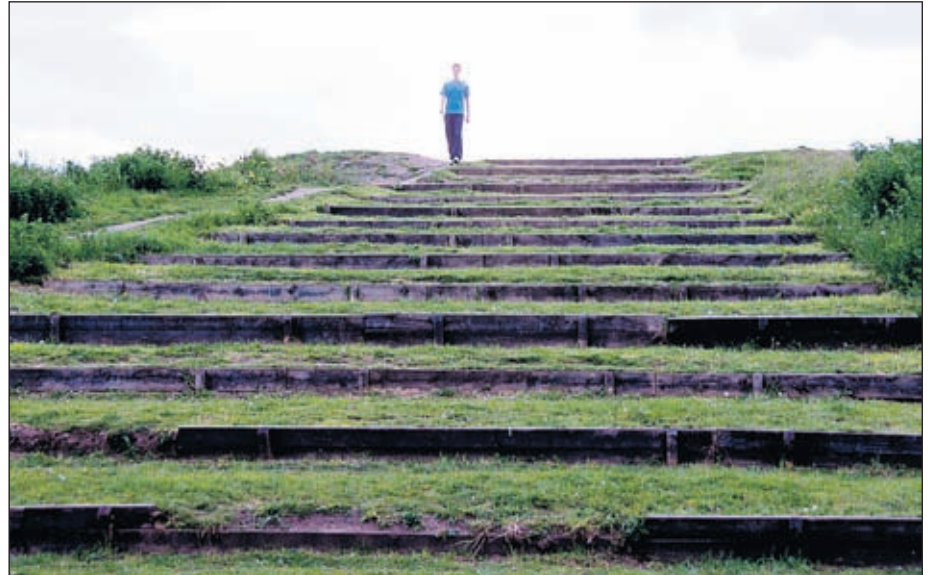
Great views from the top of The Mound

Our route leaves the park briefly here. However, if you fancy clocking up an extra half-mile or so, then tag on a visit to the skateboard park, go-kart track and young children's playcentre. They're worth a detour, especially if you have children – to find them, skirt left around the mural-fronted stadium and running track and head through the railway arch by all-