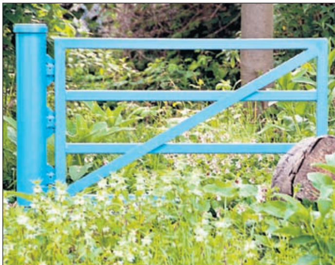
Mile End Park's 'blue gate to anywhere'