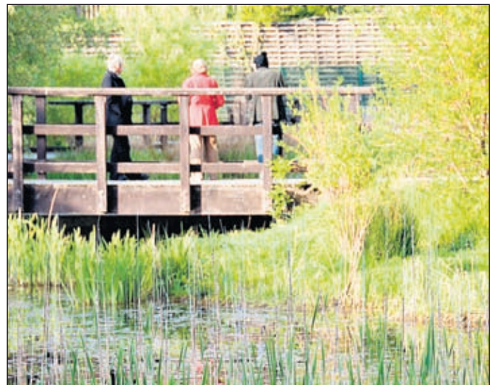
The natural beauty of the Ecology Park