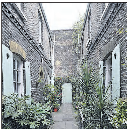
The Norton Folgate Almshouses