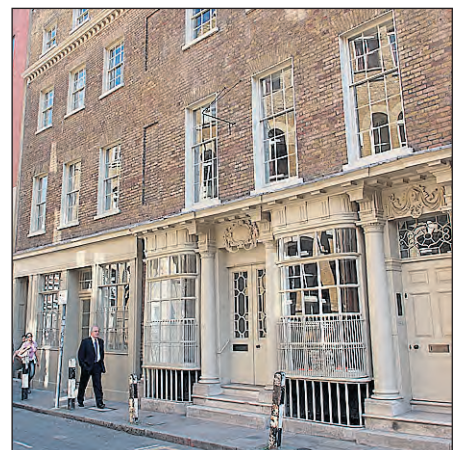
The splendour of the Raven Row gallery