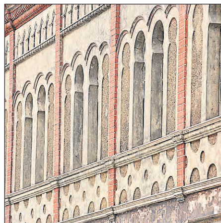
The Moorish Market in Fashion Street