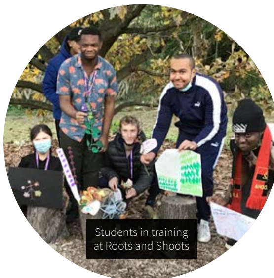
Students in training at Roots and Shoots