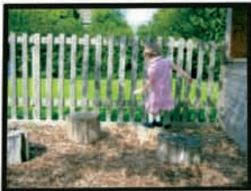
Harriet enjoyed stepping from one log to another. I challenged her to jump between the logs and she then jumped from one log to another, just stepping between two logs on the way. Child initiated