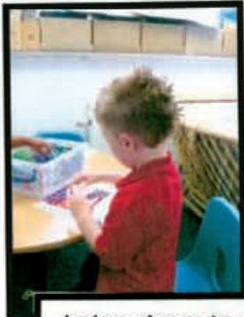
Jaden filled a peg board with pegs, easily holding and placing the pegs into the holes (child initiated).