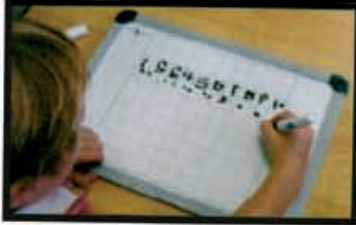
Harriet copied the numerals from 1 – 10 onto a whiteboard (child initiated).