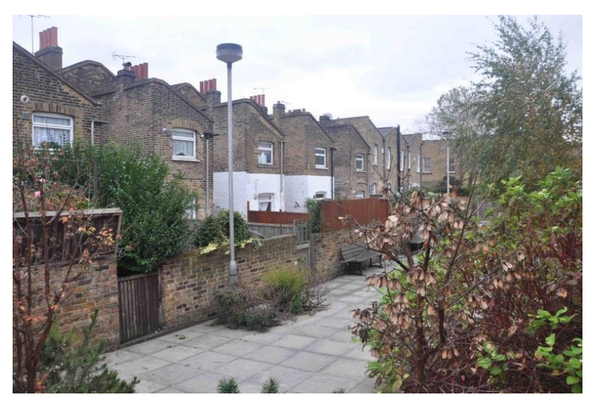
Rear of houses on Barnes Street showing two storey rear extensions with mono pitch roofs (above).

Map 2, appended to this Addendum includes a thorough audit of the existing types of rear extension which are located within the York Square Conservation Area. (To gain a full picture, the audit includes all rear extensions in the Conservation Area, including listed buildings).