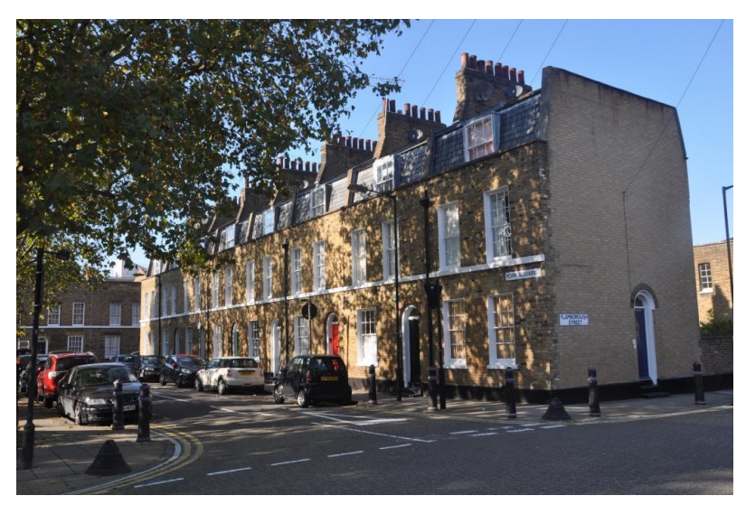
Original mansards facing the open space on York Square (above): the one at either end is hipped, it is this which allows the gable to have a straight top.

Several terraces within the area feature traditional mansard roofs which are less common in London than is often supposed. The inclusion of a mansard roof gives the terraces a very different feel from the adjacent terraces with London roofs. The mansard roof increases their height and alters the way they relate to the street. It also alters their character substantially. Those terraces on the North and South side of York Square have what appear to be original mansards and are of a larger scale. This is possibly the result of their position on the main square within the area.