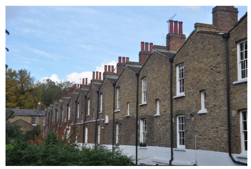
Troon Street looking North (above).