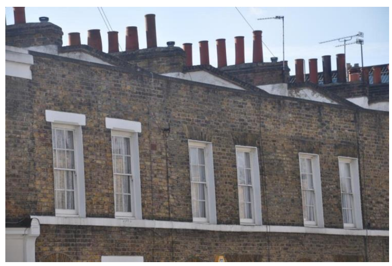
Chasely Street, the modified London roof is visible from the street (above).

There are also a number of roofs which offer a slight variation on the London Roof, the valley gutter runs to front to back as usual, but at the front each pitch is hipped. This hip spans part of two properties with the running up the middle to the chimneys on the ridge. This type of roofs can be seen on Flamborough Street, Chasely Street and Salmon Lane.