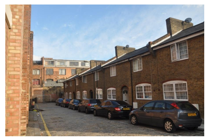
Cranbrook Cottages (above)

The Conservation Area also includes examples of simple double pitched roofs, but these are few and far between. Cranbrook Cottages on Bere Street is one example. These are modest turn of the century properties.