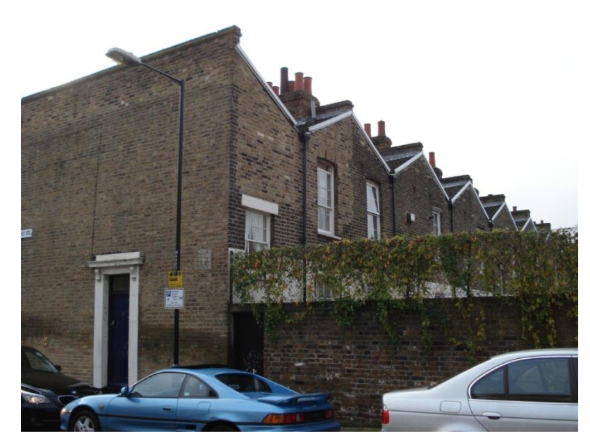
Rear of Aston Street from Matlock Street London (or Butterfly) roof – rear elevation (above): The parapet is omitted from the rear elevation of houses with London roofs exposing the distinctive pattern of gables and valleys to view.