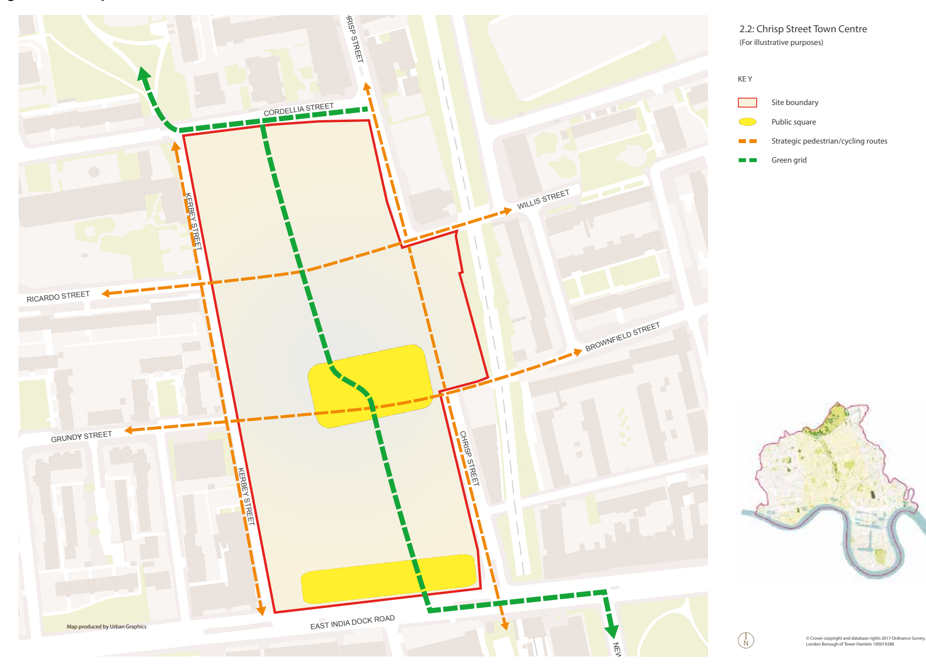
Figure 30: Chrisp Street Town Centre