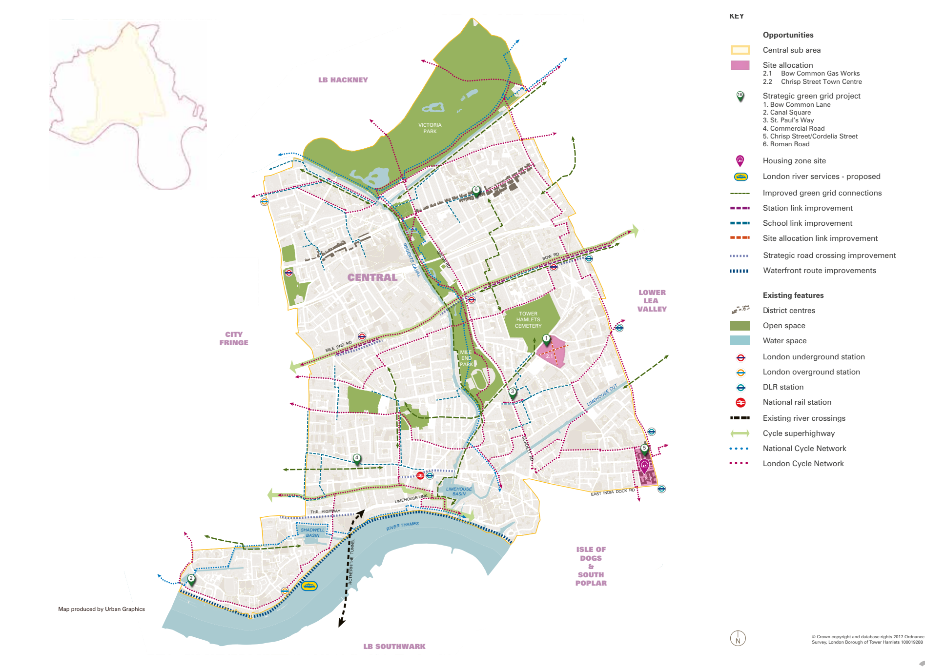
Figure 27: Vision for Central