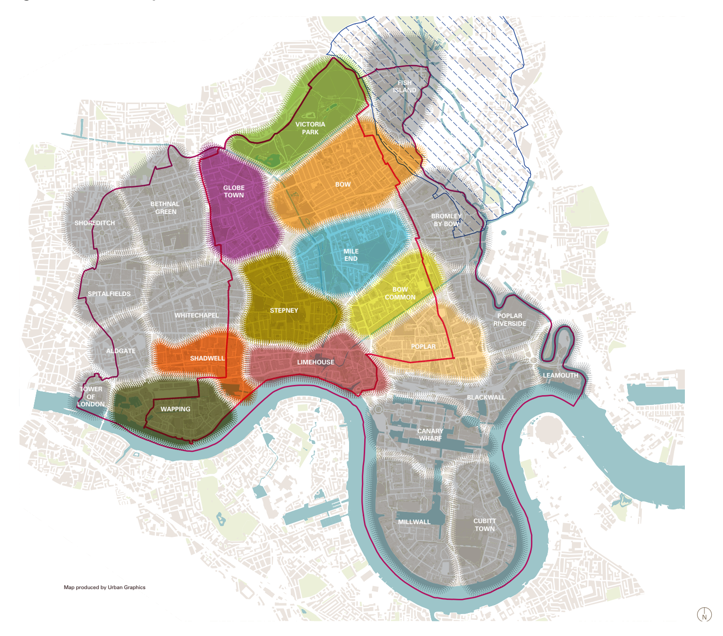
Figure 26: Character places in Central