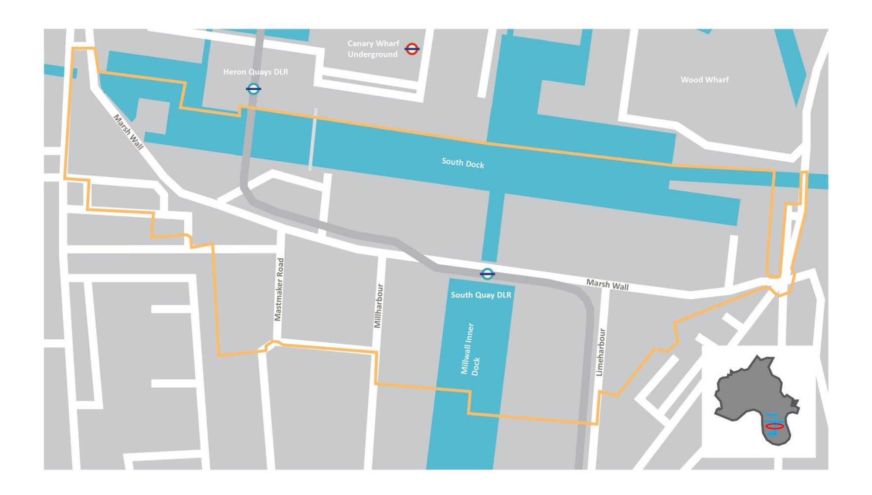
Figure 1.1- Masterplan SPD boundary and location within wider borough