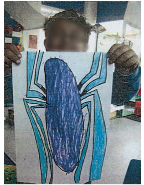
Hireh worked away quietly on the craft table, eventually emerging with a blue spider – completely independent work!