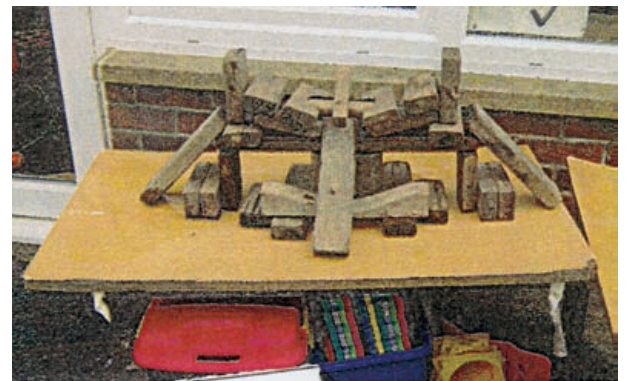
Hireh spent a long time making a bridge from our outdoor wooden blocks. Hireh was very proud of his creation and insisted on a photo when finished.