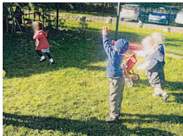
Hireh joined in with friends playing bat and ball, good range of skills evident.