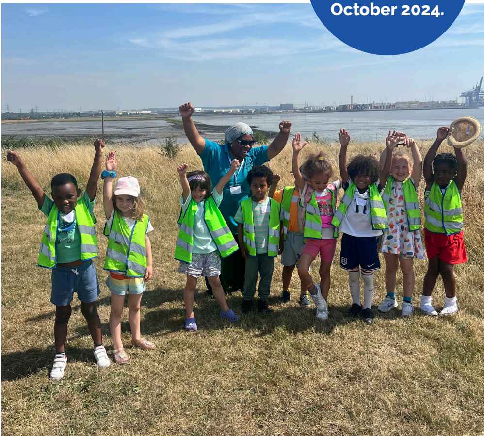
Children on a day trip to Thameside Nature Discovery park in Thurrock