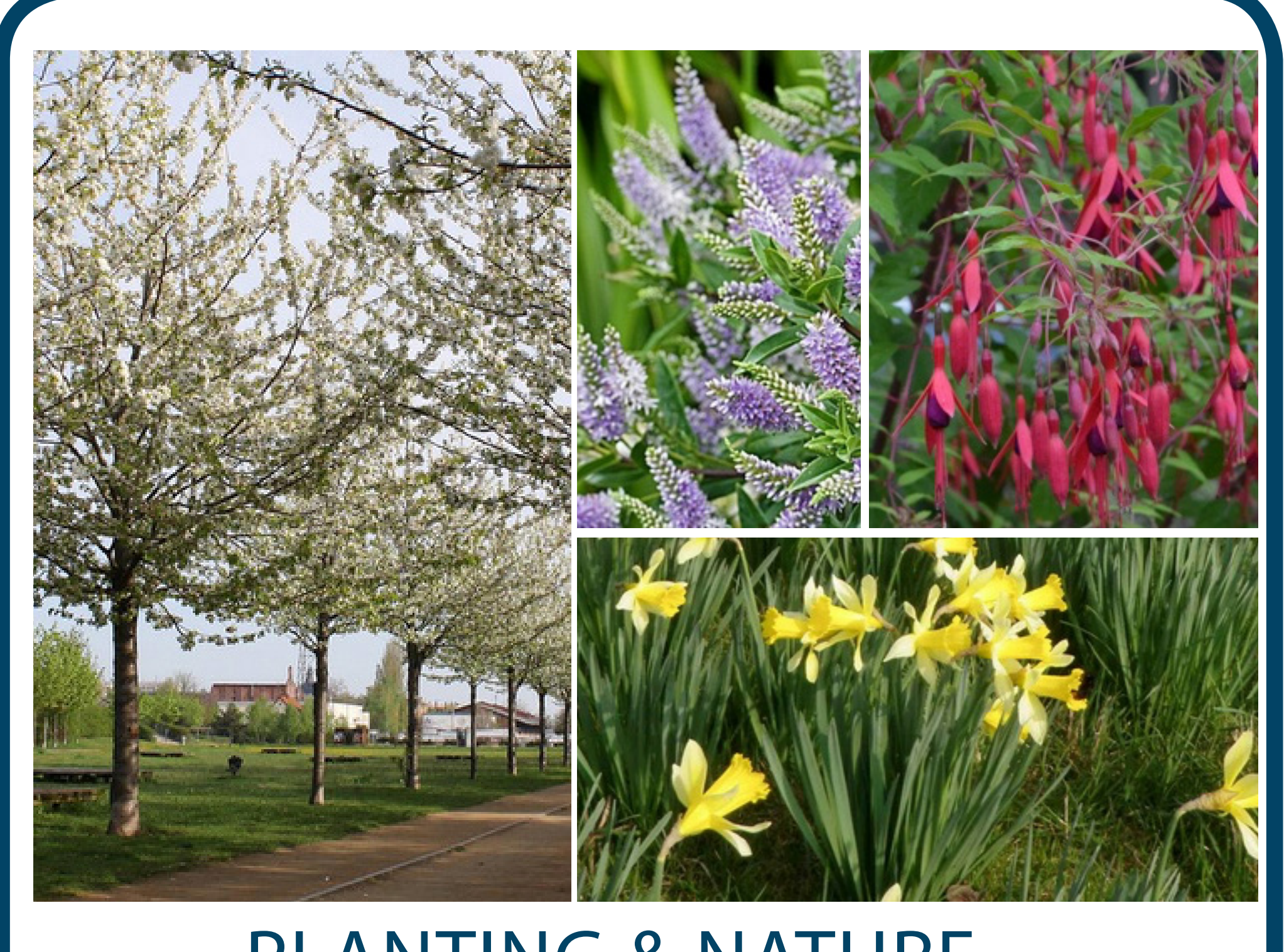
PLANTING & NATURE