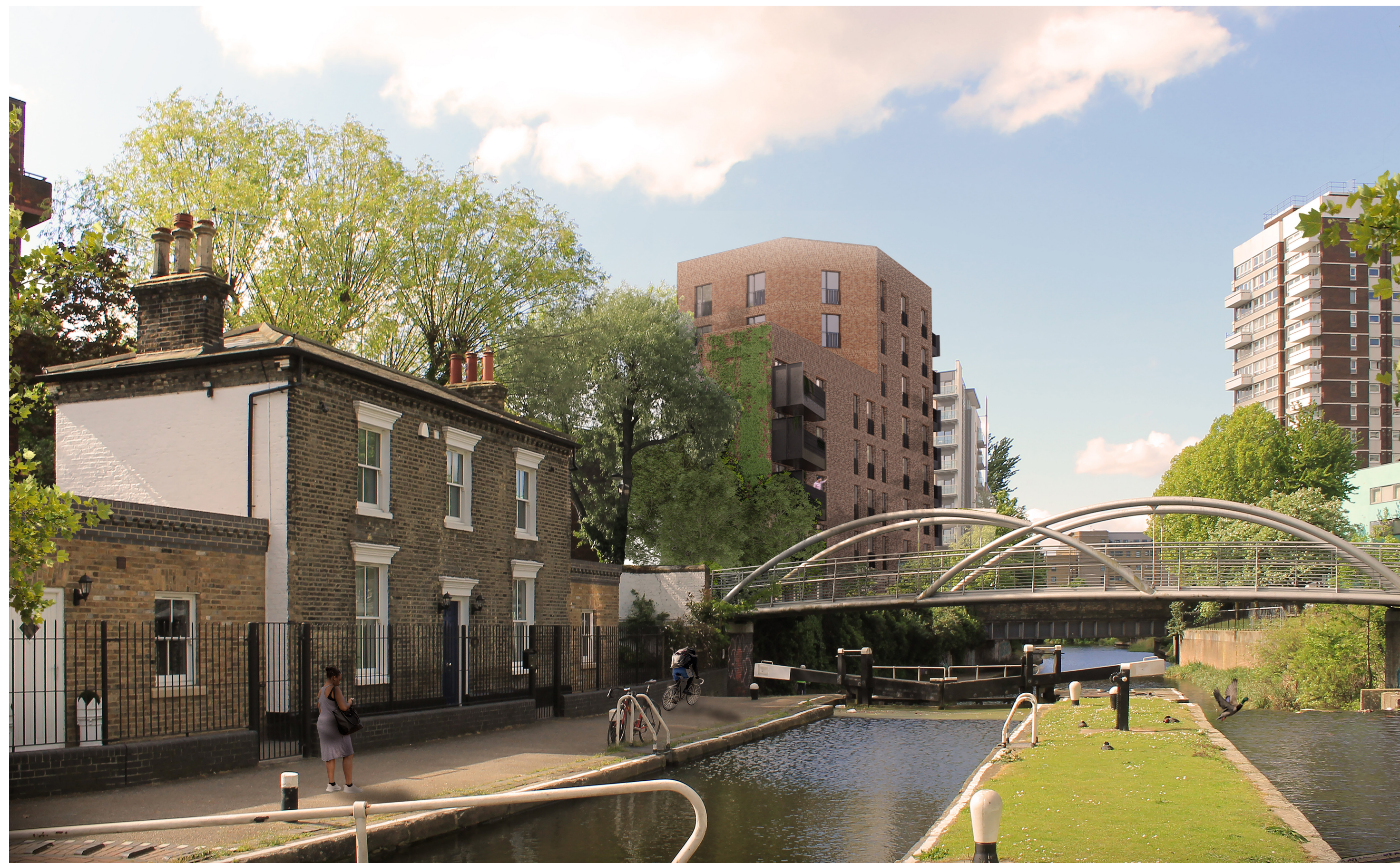
Artist's impression of proposed new homes, view from north