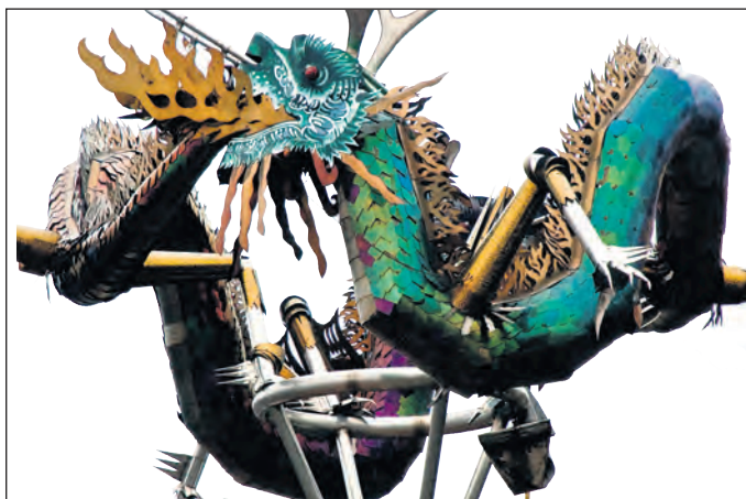
This pair of metallic dragons can be spotted at Dragon's Gate along West India Dock Road

With thanks to Rachel Maile for trialling this walk.