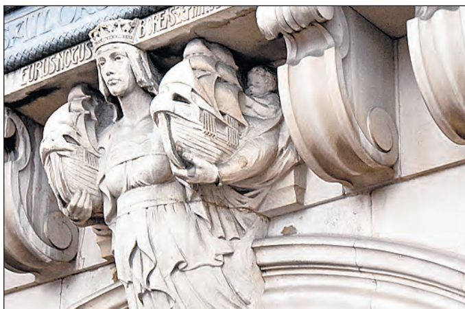
A figurehead over the door at the Sailors' Palace