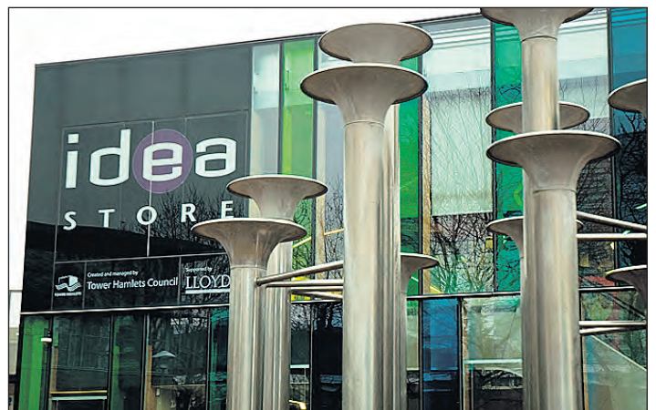
Silver trumpets outside Idea Store Chrisp Street