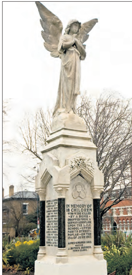
The Angel memorial in Poplar Park erected in memory of 18 schoolchildren killed in the first daylight air raid on London in June 1917

By the circular garden the hauntingly beautiful Angel Memorial commemorates 18 schoolchildren killed in June 1917 during the first daylight air raid on London. Keep on the main path – past the adventure