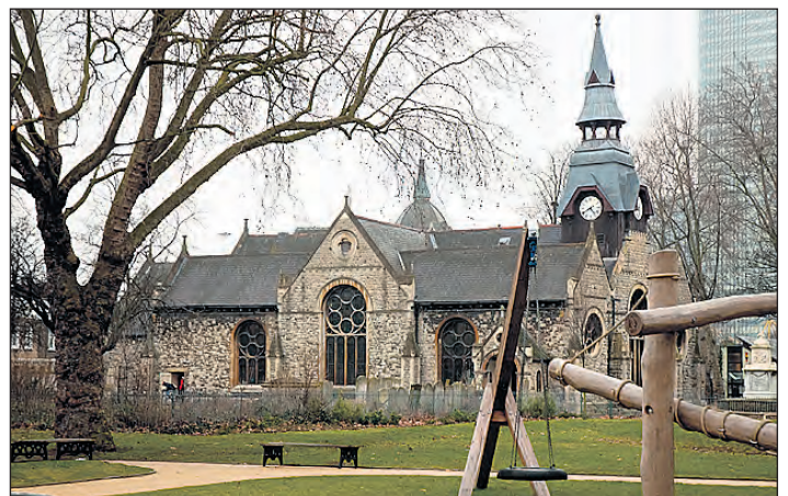
St Matthias Community Centre, with Poplar Park adventure playground in the foreground