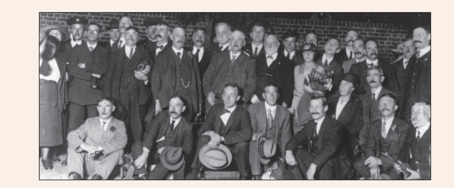
The freed councillors, with the lawyer and some of their supporters, outside Brixton Prison after being released, 12 October 1921

Supporters held daily demonstrations, and Stepney and Bethnal Green councils voted to refuse to pay the precepts too. In mid-October, the government conceded, arranged for the councillors' release, and quickly passed a law reforming London's local