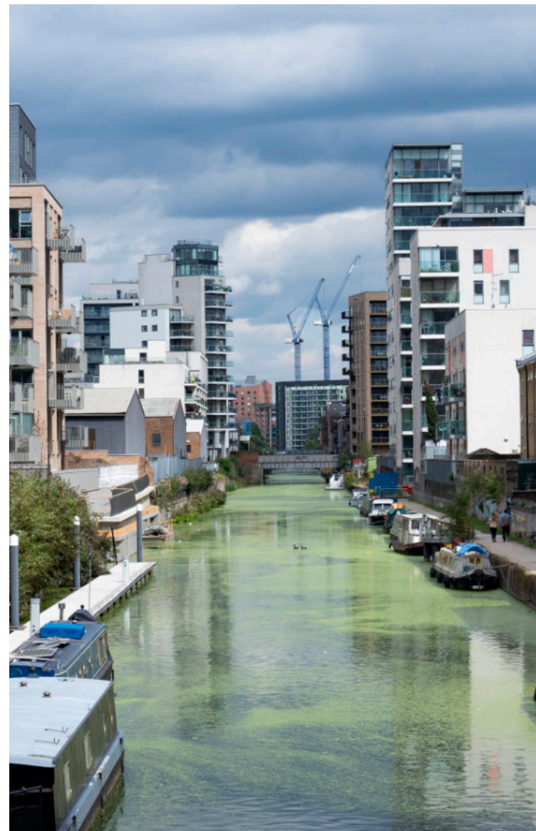
Limehouse Cut

Membership of the panel is reviewed each year, so that panel members have the opportunity to decide if they want to carry on being involved, and LB Tower Hamlets can assess whether the group is performing its intended role effectively.