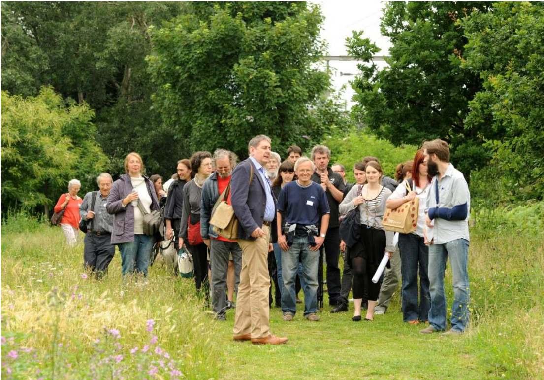
A guided walk in Mile End Park

The Mayor has pledged to protect Parks and spending on parks.