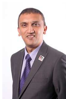
Mayor Lutfur Rahman

A handwritten signature in black ink, appearing to be 'L. Rahman'.