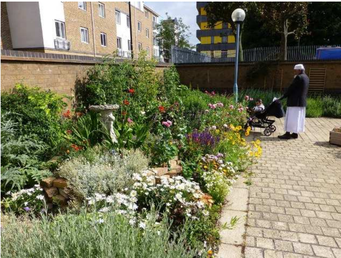
Winterton House Organic Garden has lots of nectar-rich flowers for bees

Landscaping around industrial premises may not need to look too “tidy” all the time, and often doesn’t have a recreational function. This offers an opportunity to retain or create at ground level the open mosaic habitats which are disappearing as brownfield sites are developed, and are increasingly being restricted to green roofs.