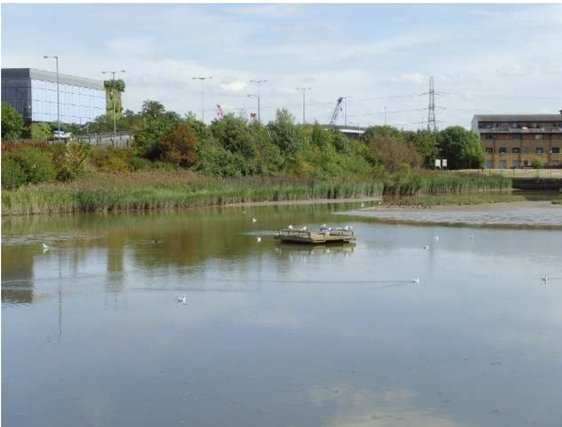
East India Dock Basin Nature Reserve is one of the best wetlands in the borough

Water quality can be enhanced through getting rid of sewer misconnections, and through sustainable urban drainage systems (SUDS) reducing surface water runoff into rivers. The priorities for biodiversity action are to diversify the habitats in the waterways and docks, control invasive species, and increase the number of ponds.