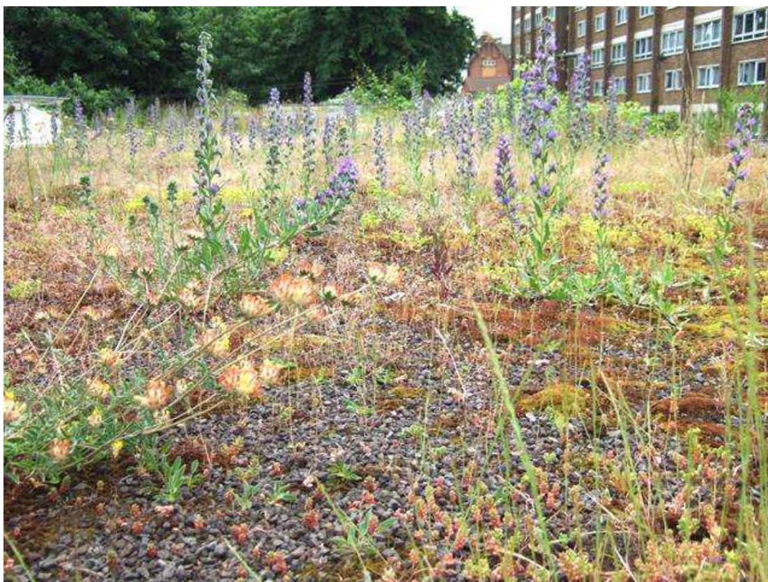
Biodiverse green roof on the Soanes Centre, Tower Hamlets Cemetery Park

We can enhance the built environment for wildlife in many ways. Green roofs are the easiest place to replace our disappearing brownfield (open mosaic) habitats. Buildings can be enhanced for bats and birds by providing custom-designed nesting and roosting sites, either built into the fabric of new buildings or retrofitted to existing ones. Climbers and other forms of green walls can provide nectar for bees and nesting sites for our declining House Sparrows. And streets can be greened with trees, hedges and planters full of nectar-rich flowers.