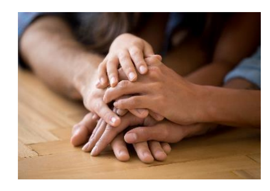
What actions will we take?

of the borough receive effective and responsive services that fully meet their needs.