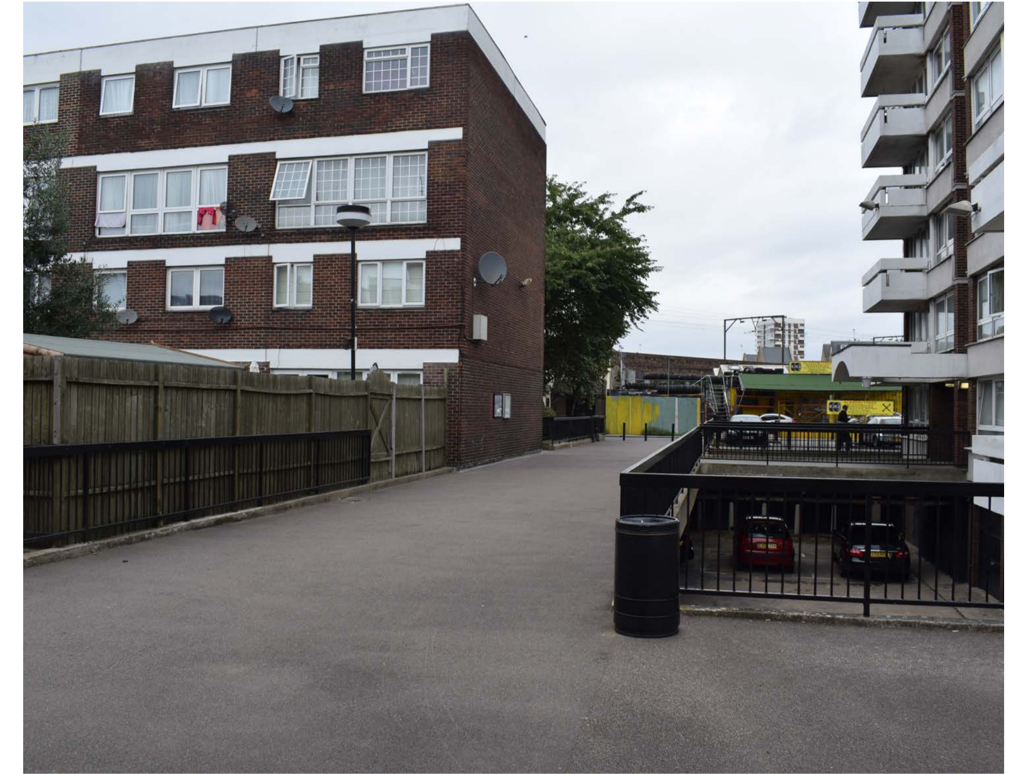
Lack of security throughout the estate