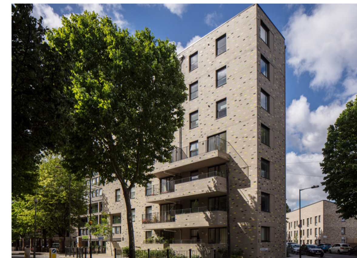
Pier Street Housing - Built