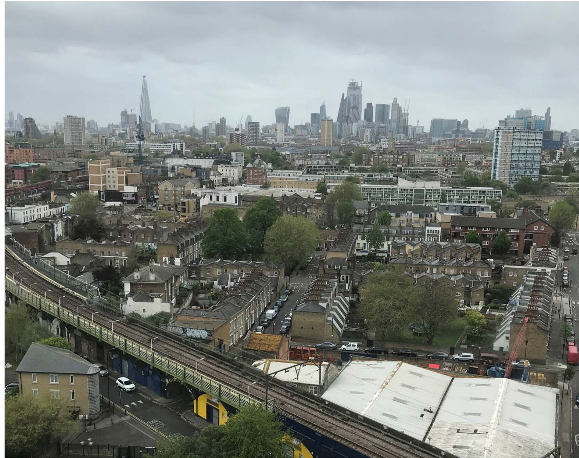
Excellent views of London from 16th floor of Anglia House