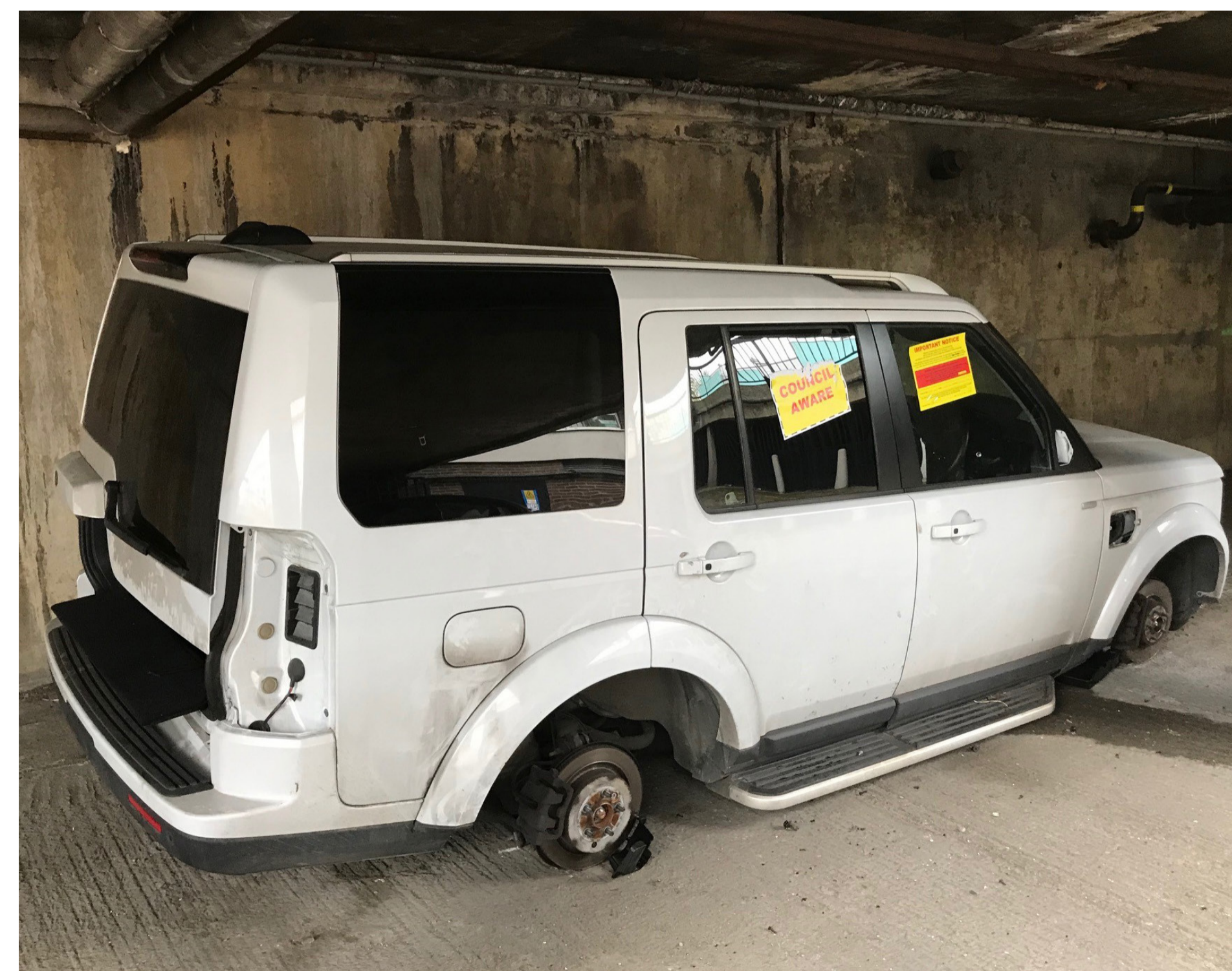
Lack of access control results in antisocial behaviour in car park