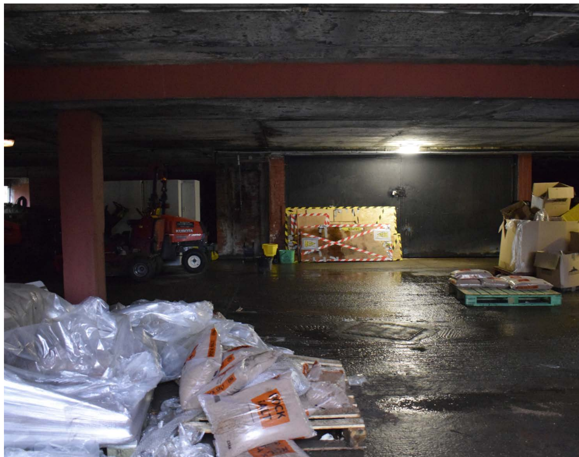
Lots of space in basement car park