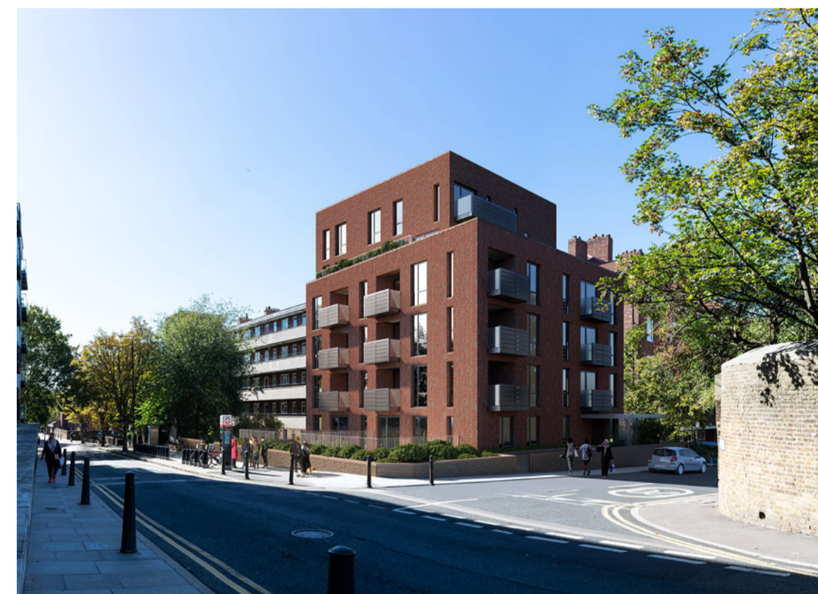
Lowder House, Wapping - Planning approved