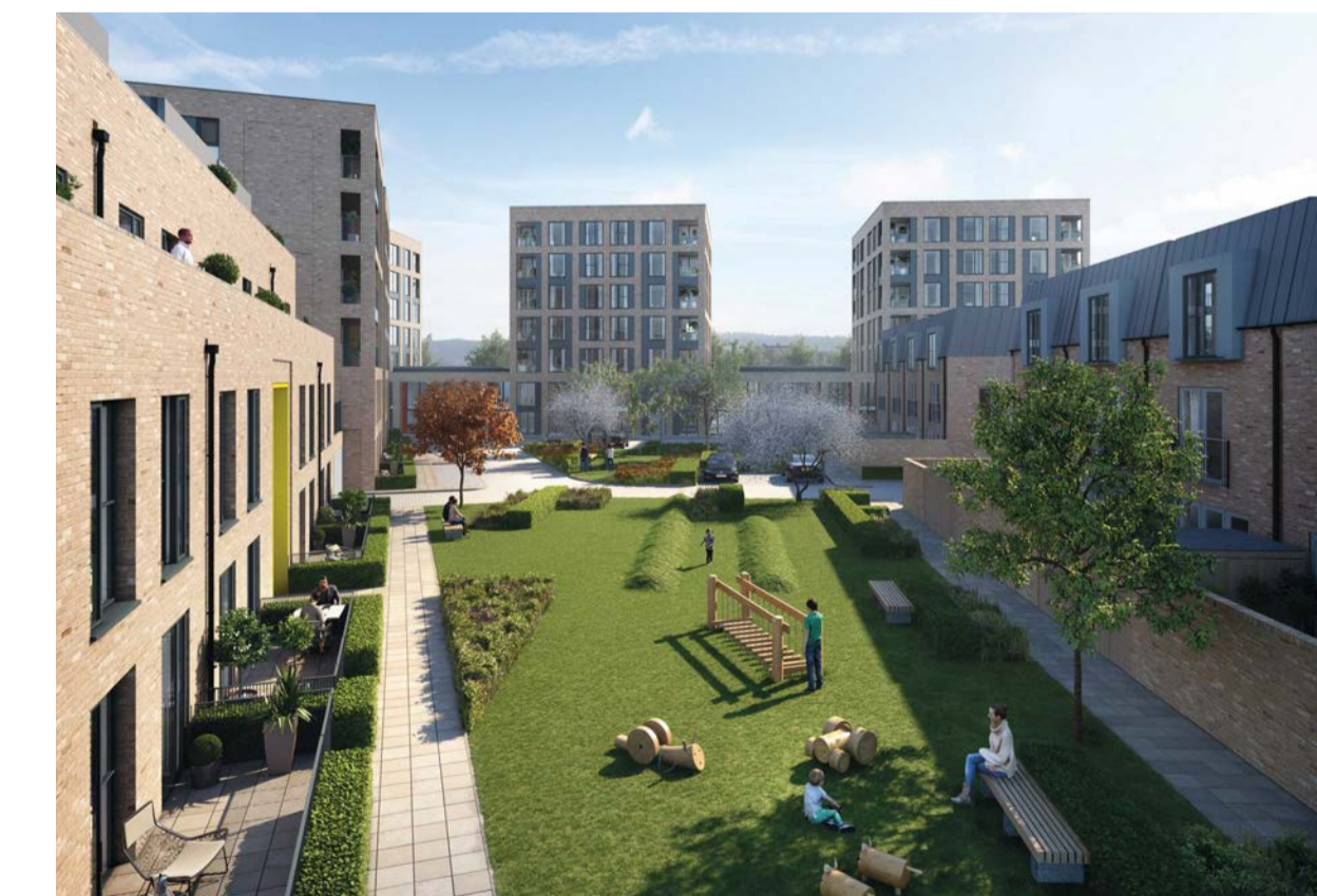
Grafton Quarter - Built