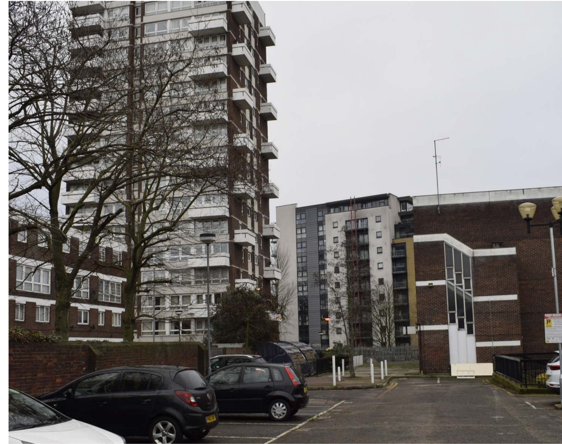
Existing parking overlooked but open to the public