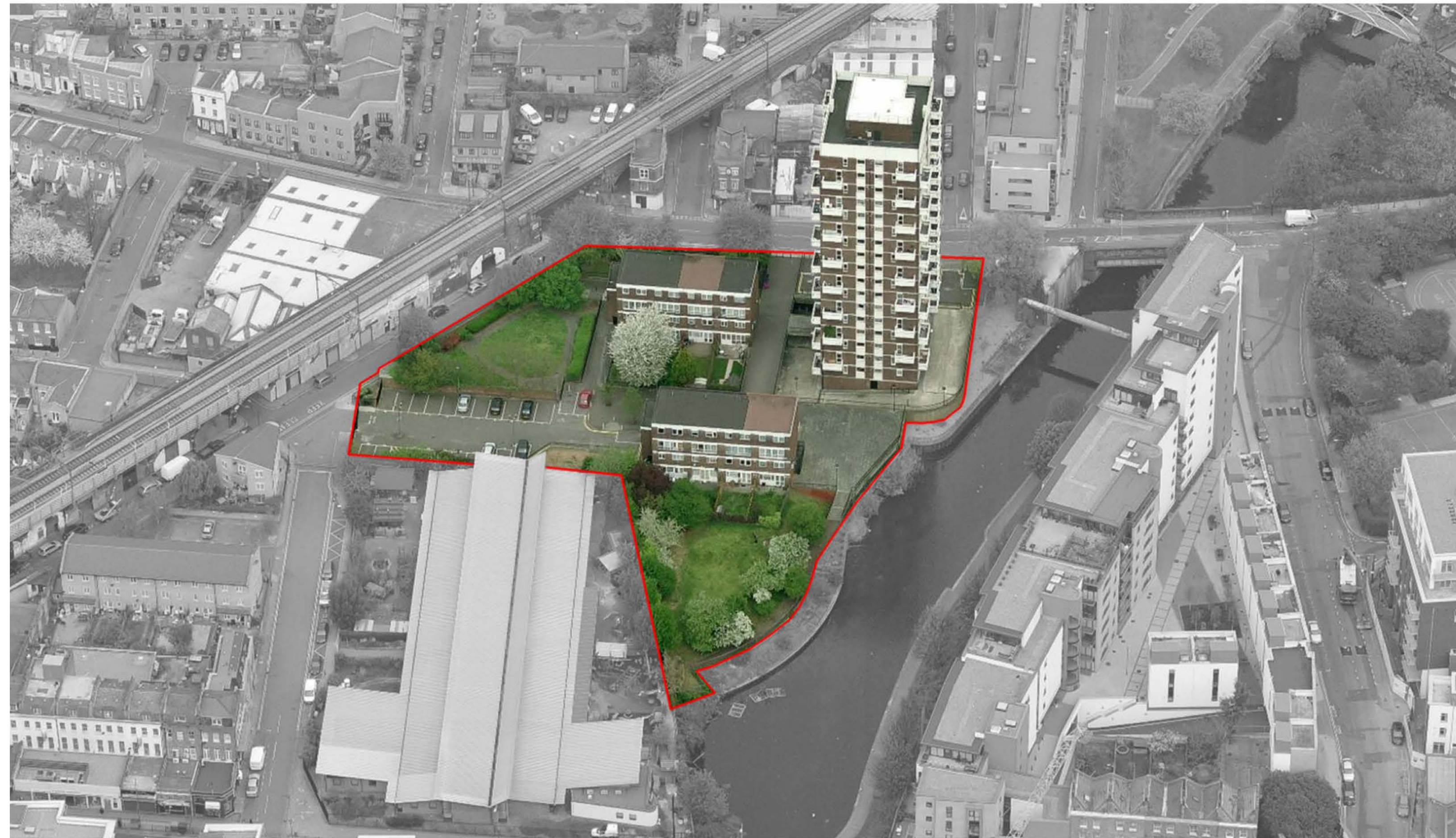
Aerial view of site