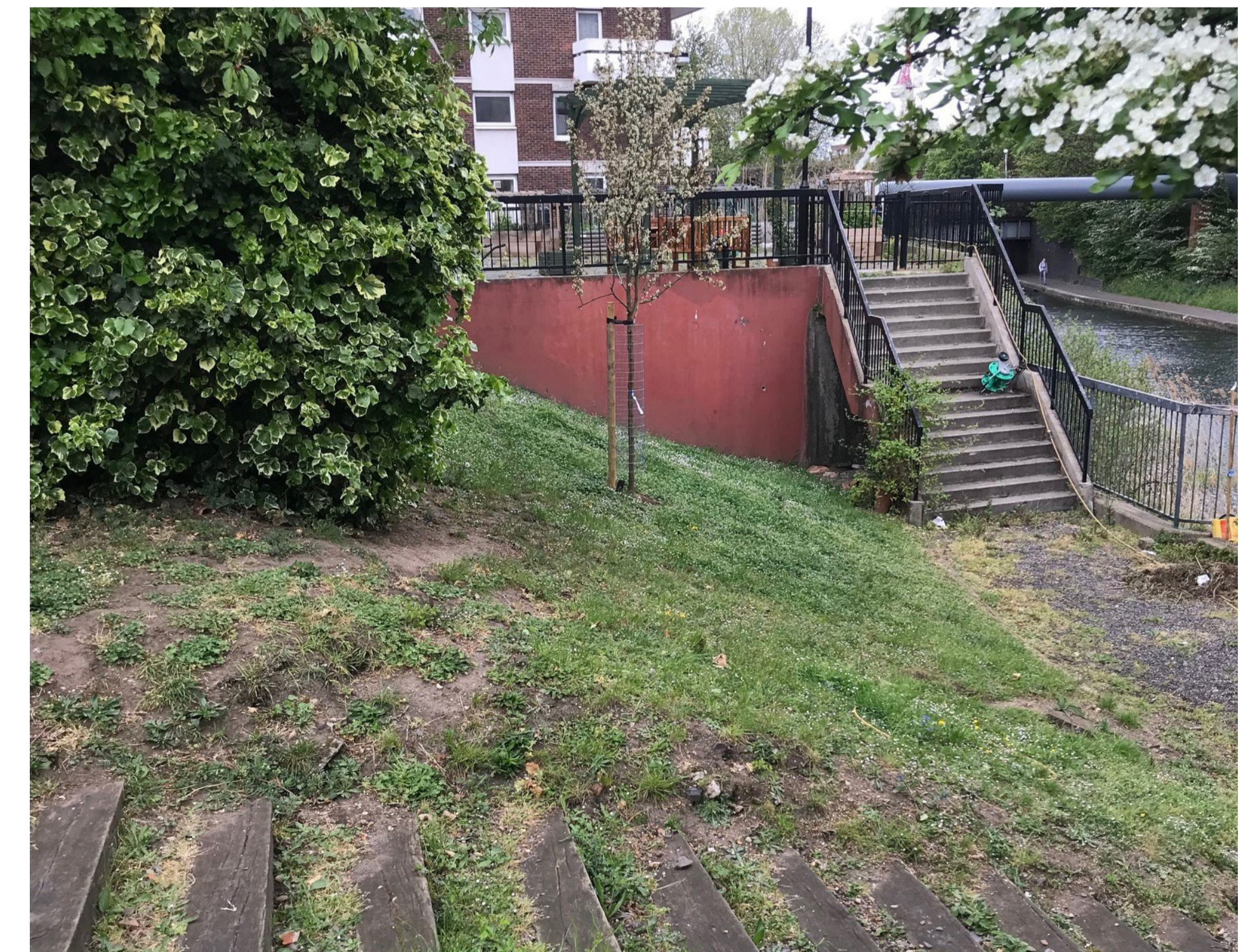
No step free access to shared garden