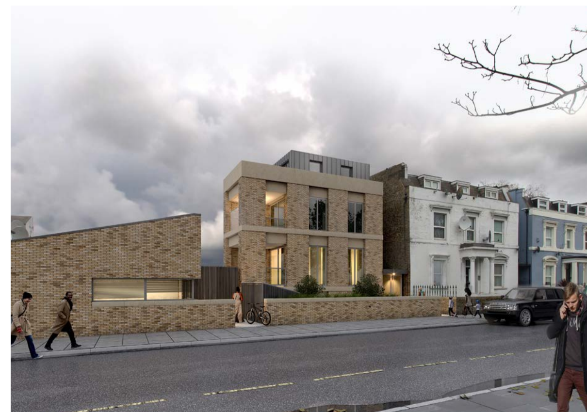
Kenninghall Road, Hackney- Planning