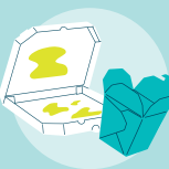
Pizza or takeaway boxes