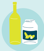
Glass bottles and jars