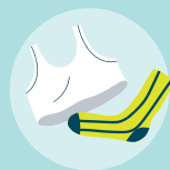
Clothes and textiles