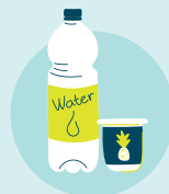
Plastic bottles, pots, tubs and trays