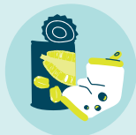
Food and drink cans