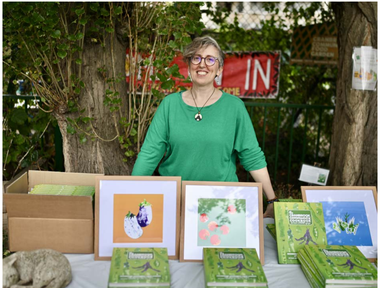
The cookbook features more than 60 recipes from quick meals to elaborate dishes

be ploughed back into the garden, ensuring that it continues to grow and thrive for years to come.