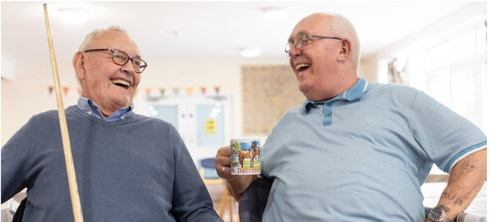
Isolation affects around one in 10 in those aged 50+ - but help is at hand in Tower Hamlets

• For more tips and information, visit: towerhamlets.gov.uk/keepwellinwinter