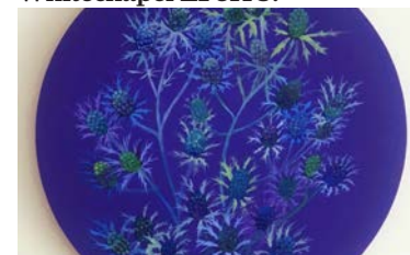
Art 4 U2

Brady Arts and Community Centre, 192-196 Hanbury Street, Whitechapel E1 5HU.