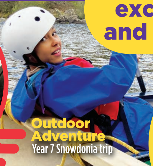
Outdoor Adventure Year 7 Snowdonia trip