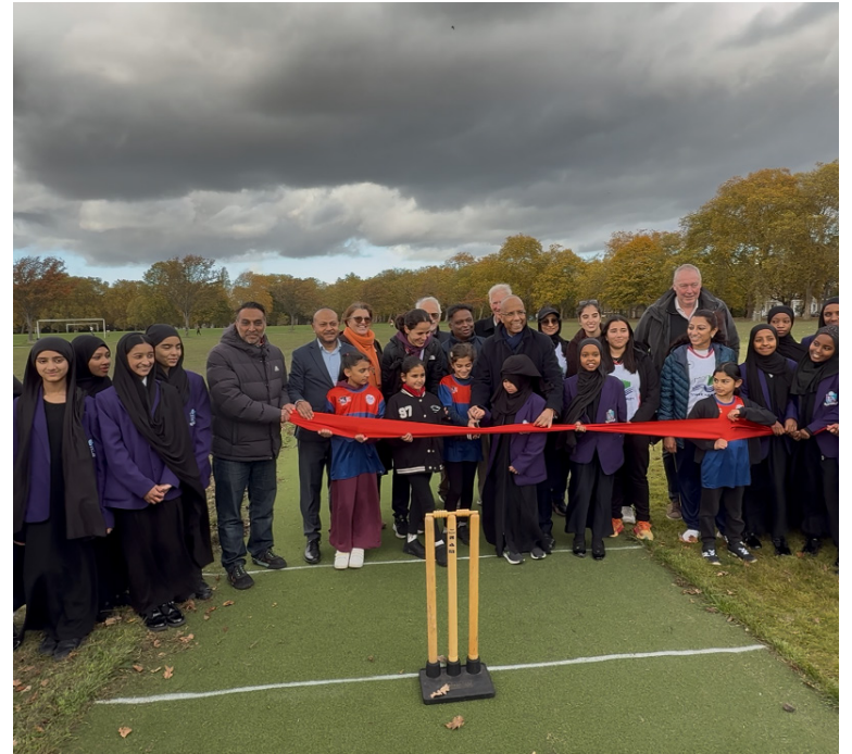
Sunday will remain a day for women and girls' cricket

international and Managing Director of Middlesex Cricket in the Community, said: "Middlesex Cricket has always been proud to work alongside Tower Hamlets Council, Capital Kids Cricket and our community partners to make the game accessible to all. We will