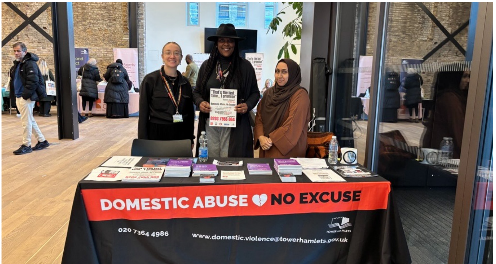
White Ribbon Day and 16 Days of Activism aim to stop violence against women