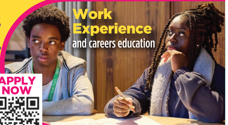
Work Experience and careers education

Sixth Form students participate in workshops, visits to universities, lectures, trips and arts events as well as a wide range of activities during their Wednesday afternoon enrichment sessions.