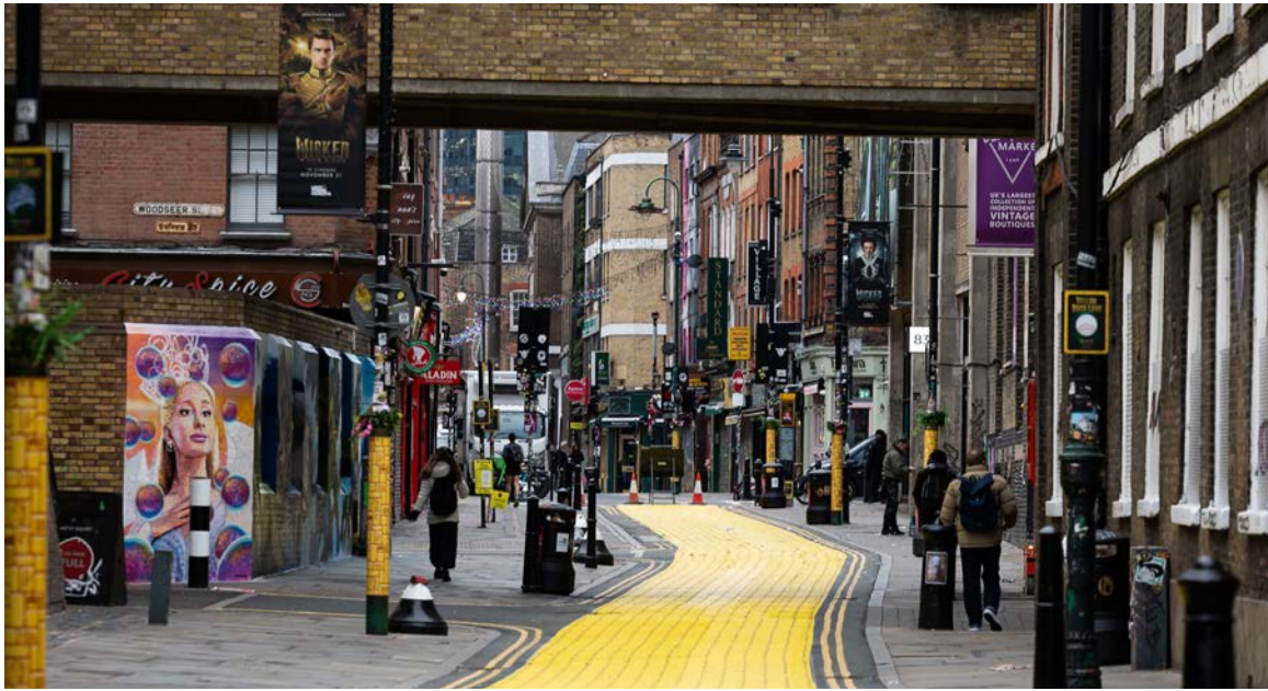
The famous street was transformed to celebrate the release of the second Wicked film