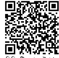
ভিডিওটি দেখতে উপরুর ছত্র কোড স্ক্যান করুন।

টায়ার হামলেটস কাউন্সিল শীতকালে ঘরে চিতিপড়া বা ছত্রাক (মৌন্ড) প্রতিরোধে নতুন ক্যাম্পেইন “ব্রেক দ্যা মৌন্ড” শুরু করেছে। অর্দ্রতা