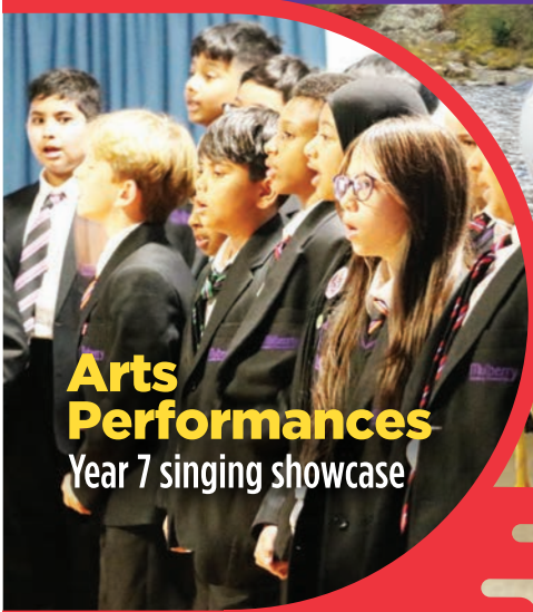
Arts Performances Year 7 singing showcase

We offer academic excellence in a fun and exciting school