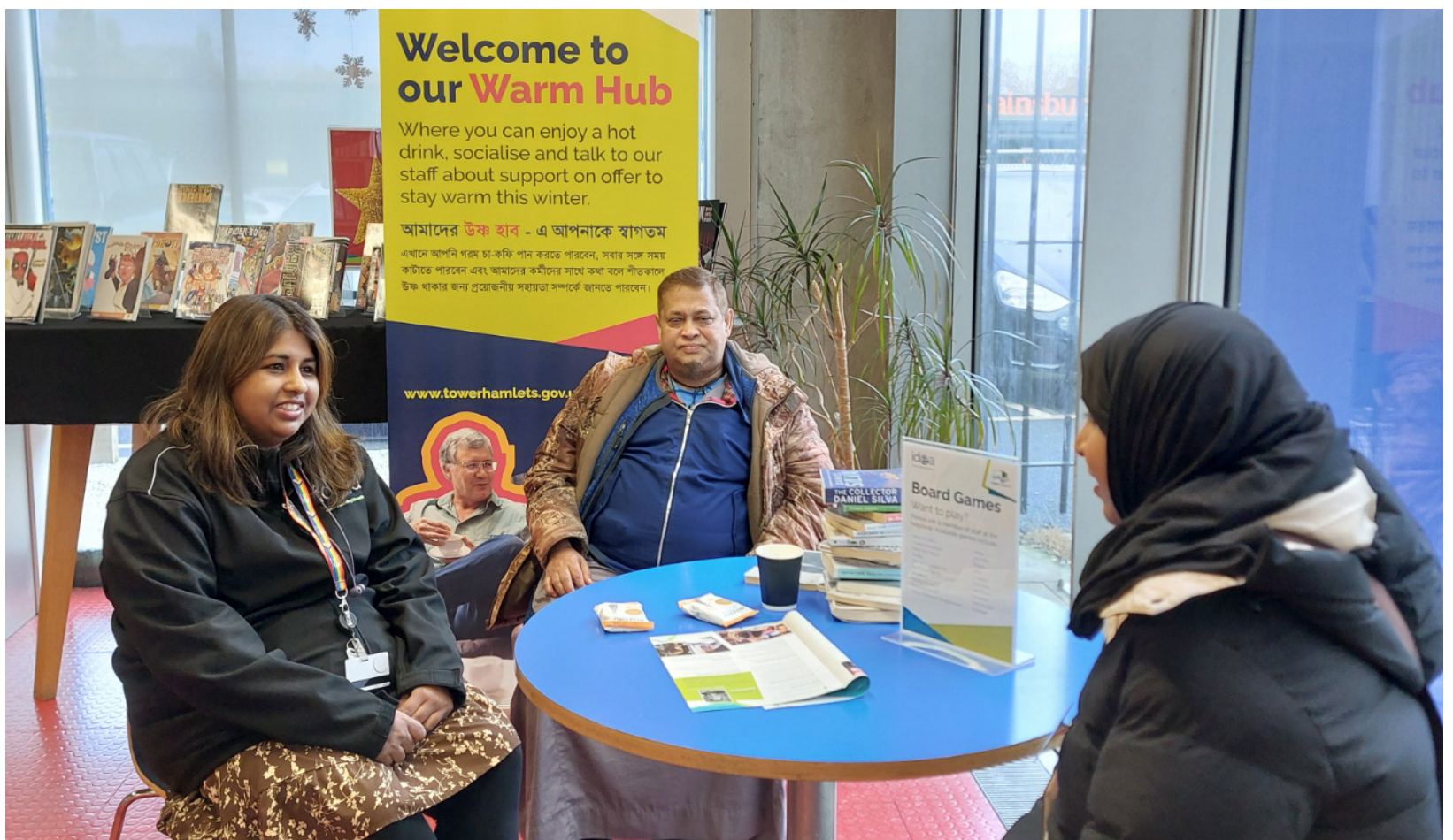
Warm hubs are at Idea Stores and libraries and offer hot drinks, snacks and support for residents