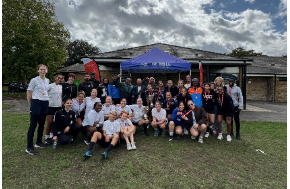
Football and cricket tournaments took place recently

Royal Regents took the open age women and London Sportif the open age men.