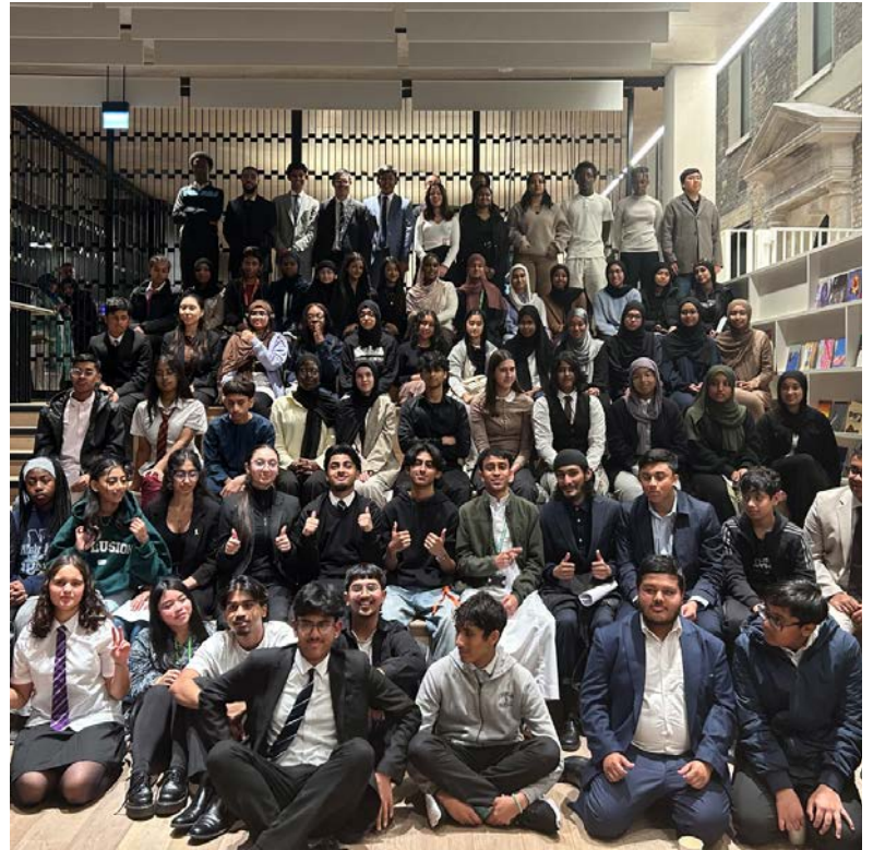
Some of the Young Mayor hopefuls

You can also follow the process by visiting www.youngtowerhamlets.org.uk/get-involved/young-mayor-of-tower-hamlets