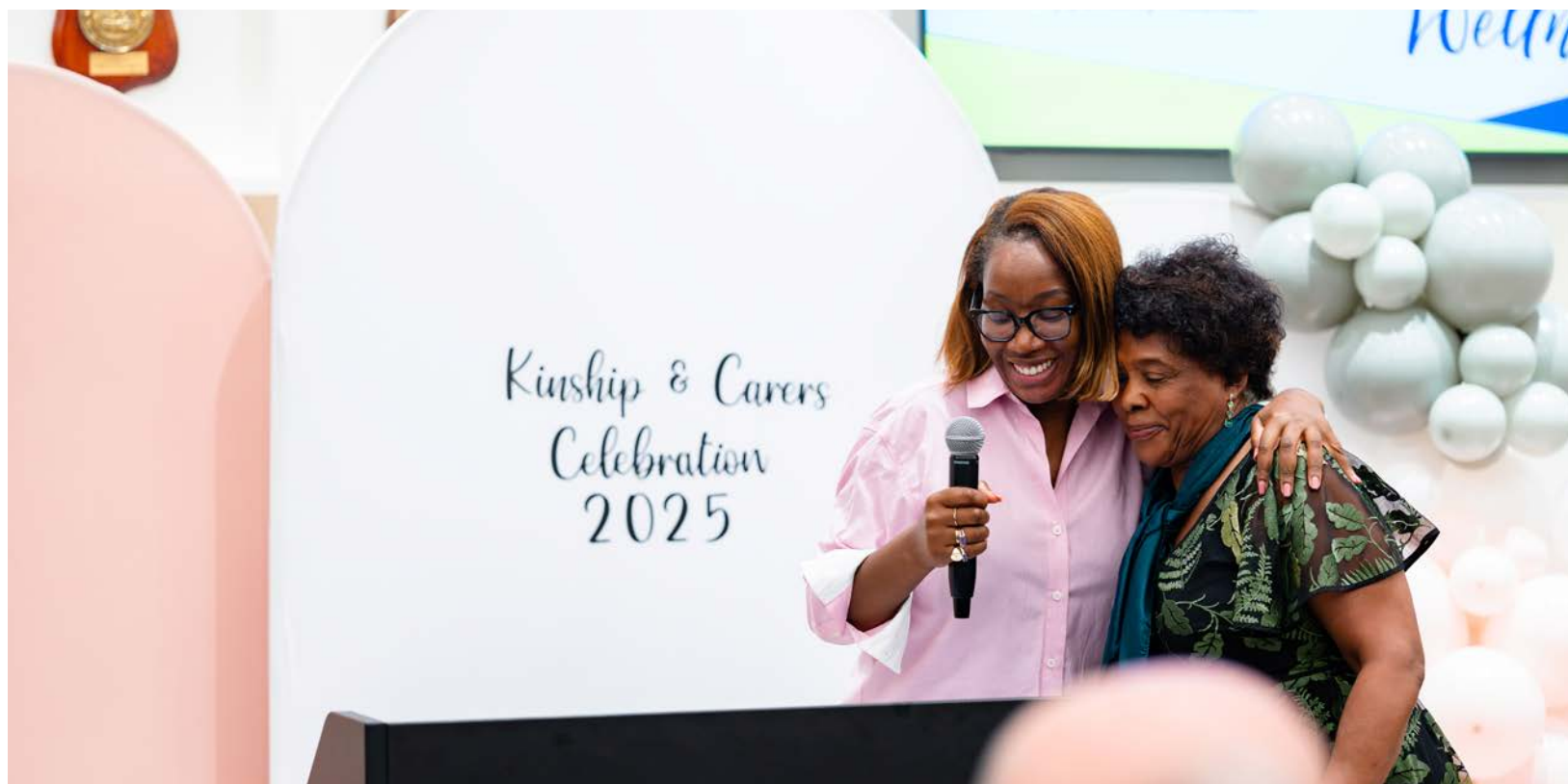
The annual event thanked foster and kinship carers from across the borough