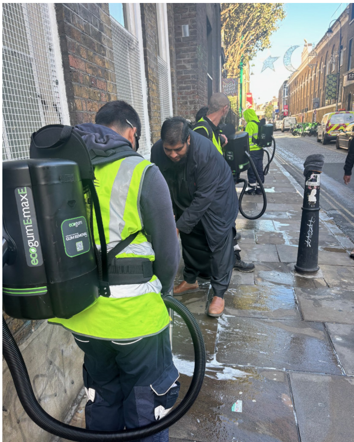
The Chewing Gum Taskforce tackled the sticky issue in Brick Lane

The council is now looking at how it can fund the taskforce to tackle more areas of the borough.