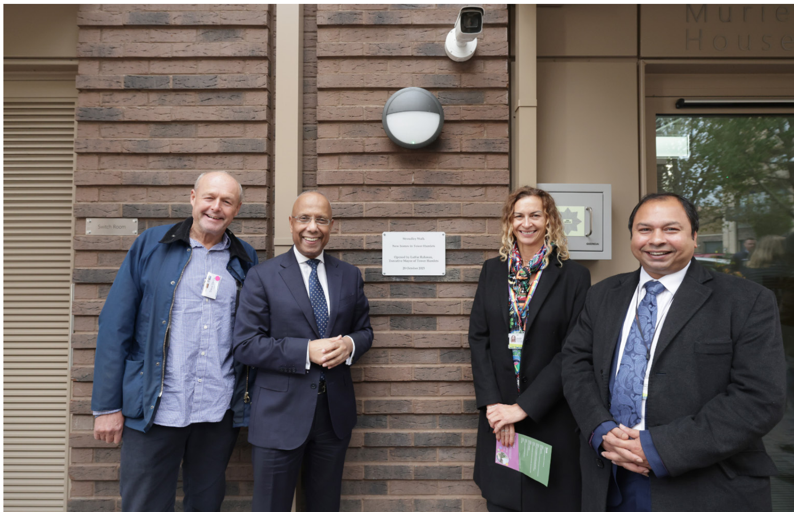
The 82 affordable homes in Bromley-by-Bow include autism-friendly houses

• Visit www.towerhamlets.gov.uk/MyHome for more information and to sign up.