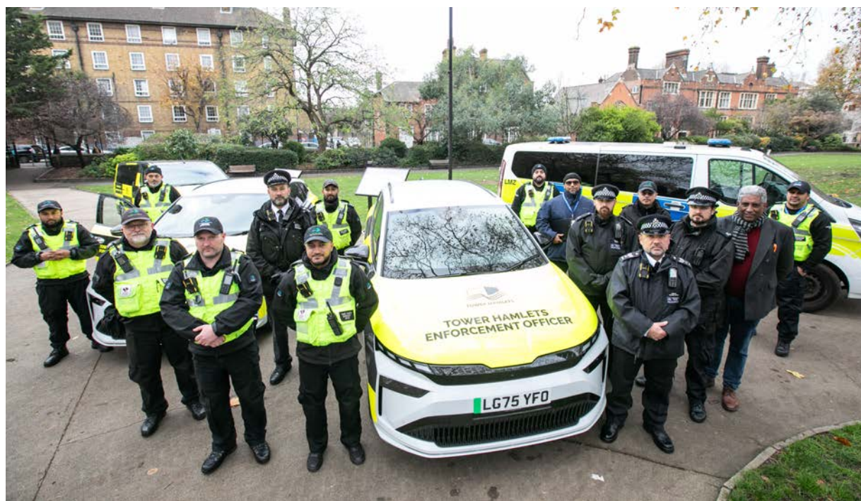
The Drugs Squad aims to support vulnerable people and tackle substance misuse and the associated ASB

Working closely with police, the council's CCTV and enforcement teams, the Specialist Substance Misuse Investigations Team (SSMIT) and other local services, the squad is using a new model