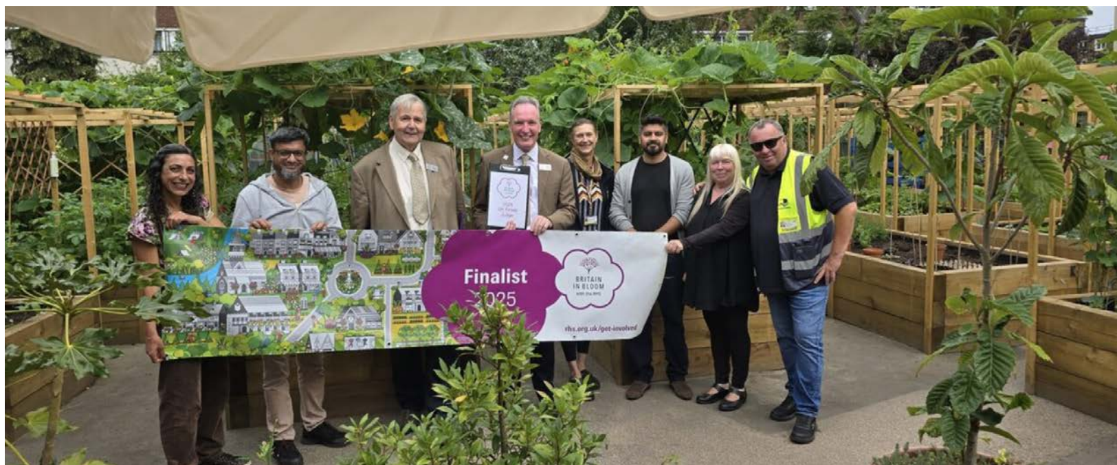
Highlights for the judges included visiting Rocky Park in Bethnal Green