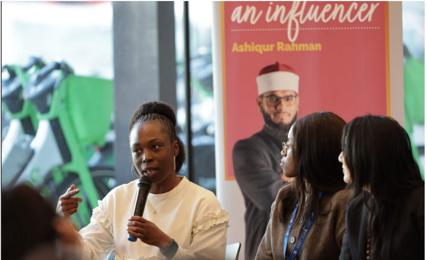
More than 50 residents took part in an intensive leadership course