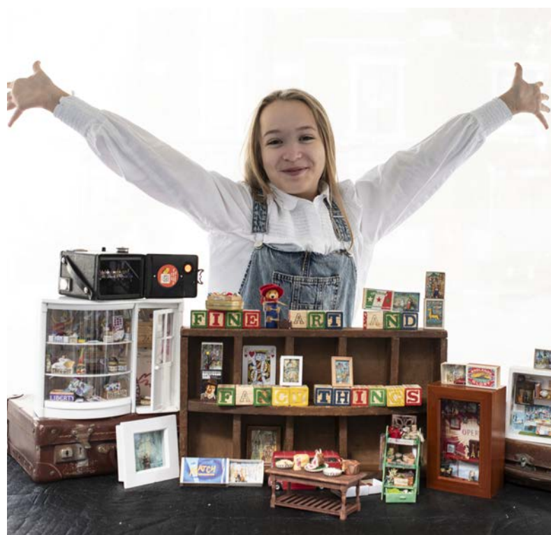
A Crowdfunder hopes to keep the market open

• To support the fundraising, visit crowdfunder.co.uk/p/eetg-market-for-bethnal-green-road