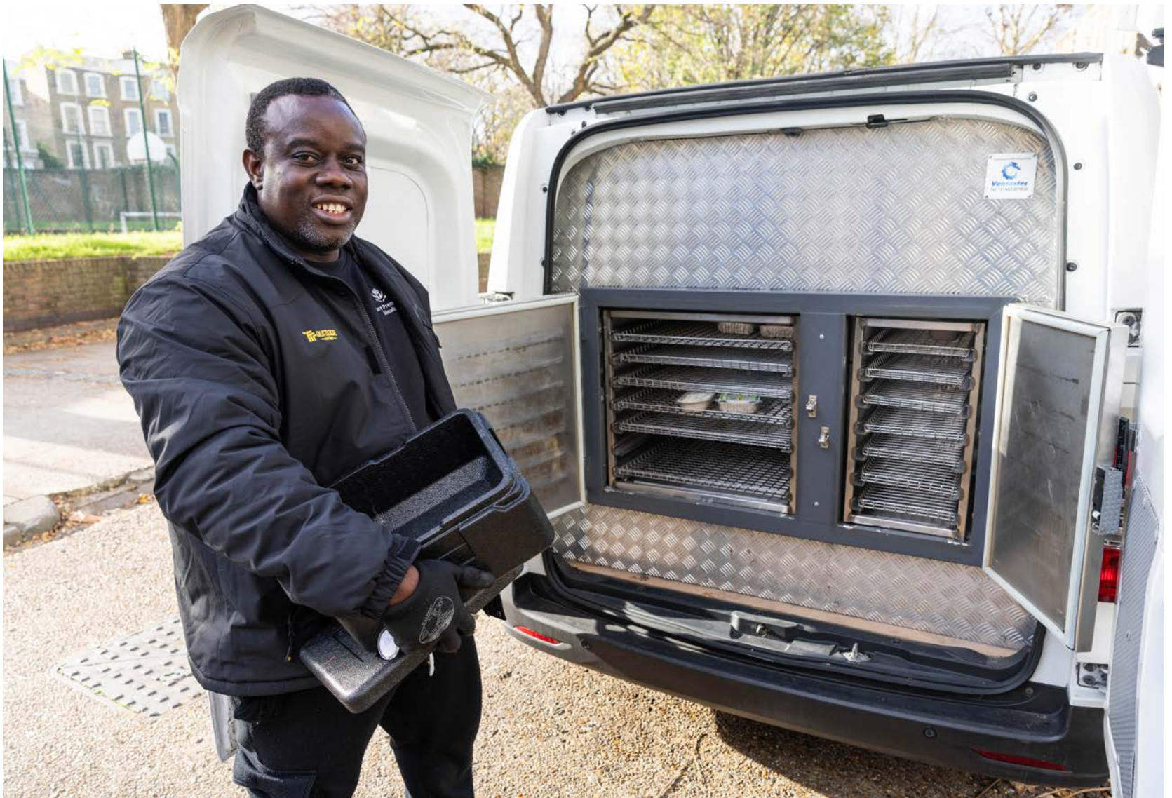
A staff member delivering the meals to residents