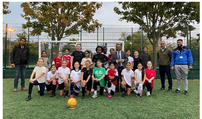
The club will give girls access to high quality football facilities

Follow @youngtowerhamlets for more updates.