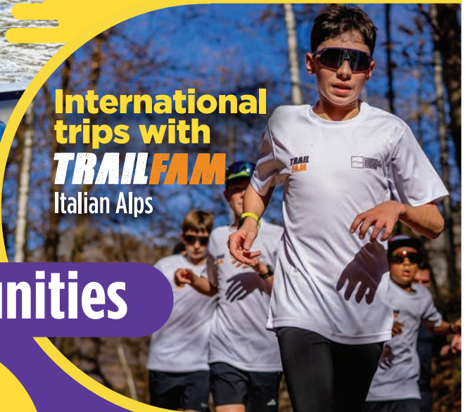
International trips with TRAILFAM Italian Alps