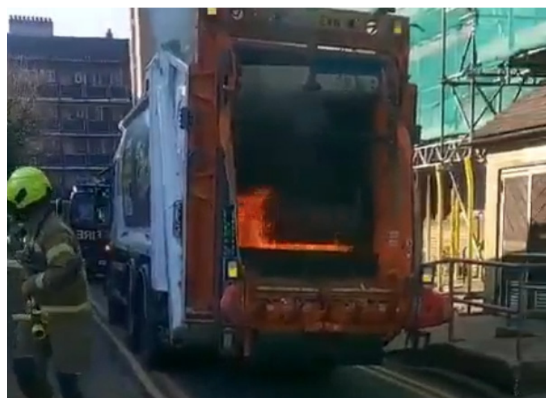
A recent fire in one of the waste trucks

Member for Environment and Climate Emergency, said: "These fires are frightening, unpredictable and completely avoidable. They not only threaten the safety of our staff but also lead to missed collections and major service delays for residents when trucks are damaged or taken out of service."