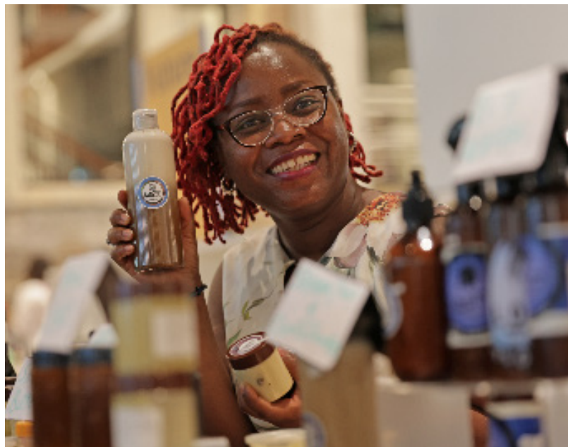
There are four projects to support entrepreneurs and small businesses

Four new projects have been launched as part of a £400,000 initiative to help residents set up their own business and support small businesses to take them to the next level.