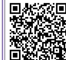
এনিমেশন ভিডিওটি দেখতে QR-এর ছত্র কোড স্ক্যান করুন।

চালু করেছে টায়ার হামলেটস কাউন্সিল। গৃহস্থালি বর্জ্যের সঙ্গে ব্যাটারি ফেললে তা আবার ট্রাকের ভেতরে ক্রাশ বা চাপা পড়ে বিস্ফোরণ ঘটতে পারে, যা কর্মীদের জন্য যেমন বিপজ্জনক, তেমনি এর ফলে বর্জ্য সংগ্রহ কার্যক্রম ব্যাহত হয়। গত বছরে আমাদের এই বরোয় ২৩টি আগুনের ঘটনা ঘটেছে, যার ৯টিই ঘটে বর্জ্য ট্রাকে। জাতীয়ভাবে এ ধরনের আগুনের