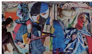
Save the Children

Brady Arts and Community Centre, 192-196 Hanbury Street, Whitechapel E1