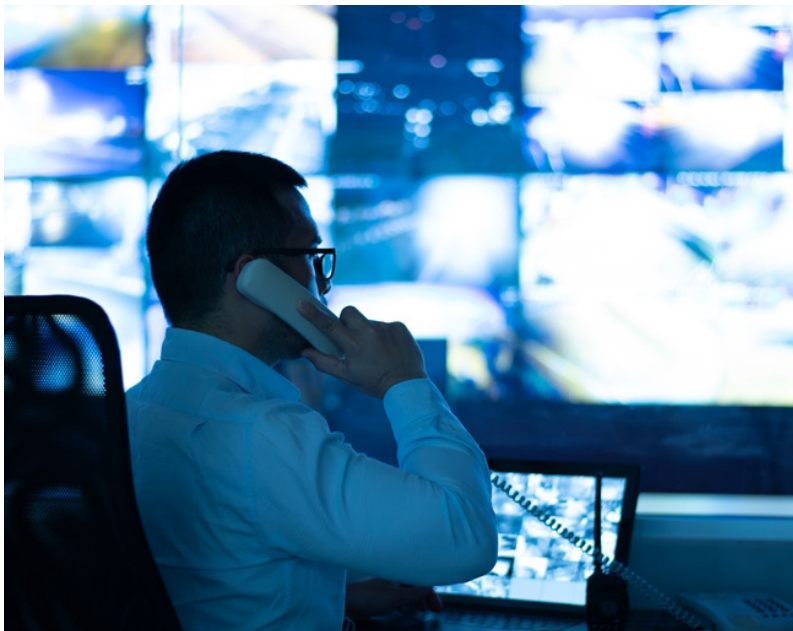
THEOs will be able to respond to live incidents

A new dedicated phone line allows residents to report anti-social behaviour and get an immediate response.