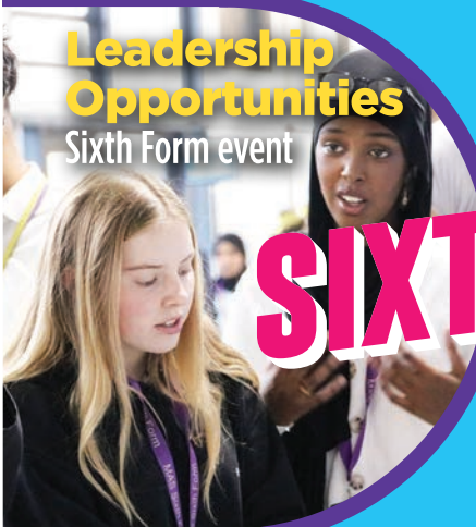
Leadership Opportunities Sixth Form event

Our students enjoy memorable cultural experiences linked to a rich, vibrant and creative curriculum that extends their learning beyond the classroom.