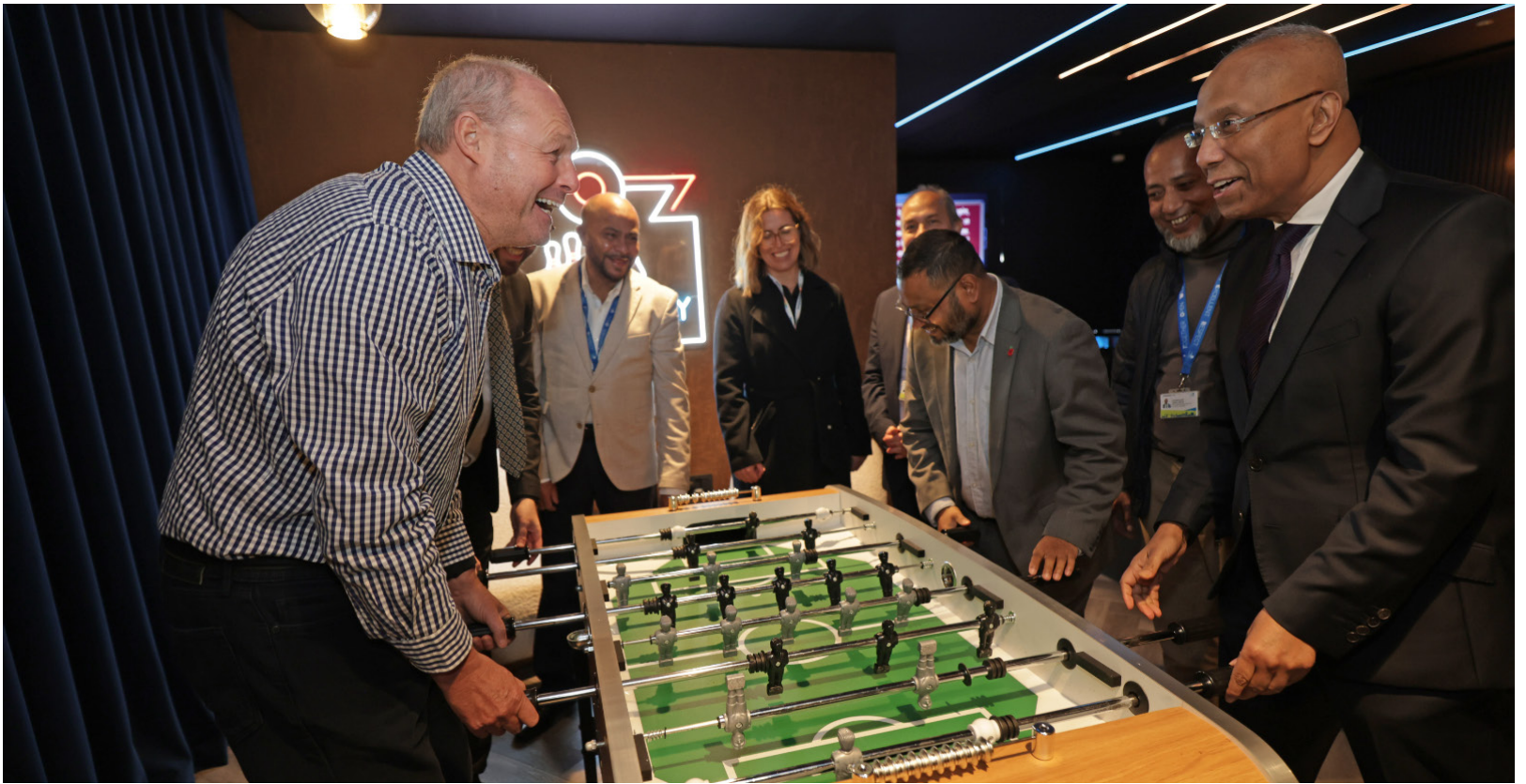
The development includes an open-air children's play area, garden space, cinema room and bowling alley