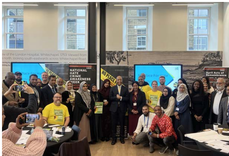
Events included a football match, peace walk and community conversations

Tower Hamlets Council engaged with around 9,000 people during events and community engagement to mark National Hate Crime Awareness Week (11-18 October).