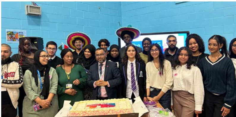
A number of events were organised

Young Tower Hamlets celebrated Youth Work Week with a vibrant programme of events, speeches, performances and workshops across local youth centres and beyond.