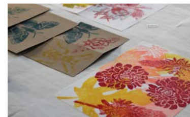
A Team Arts Education

Brady Arts and Community Centre, 192-196 Hanbury Street, Whitechapel E1 5HU.