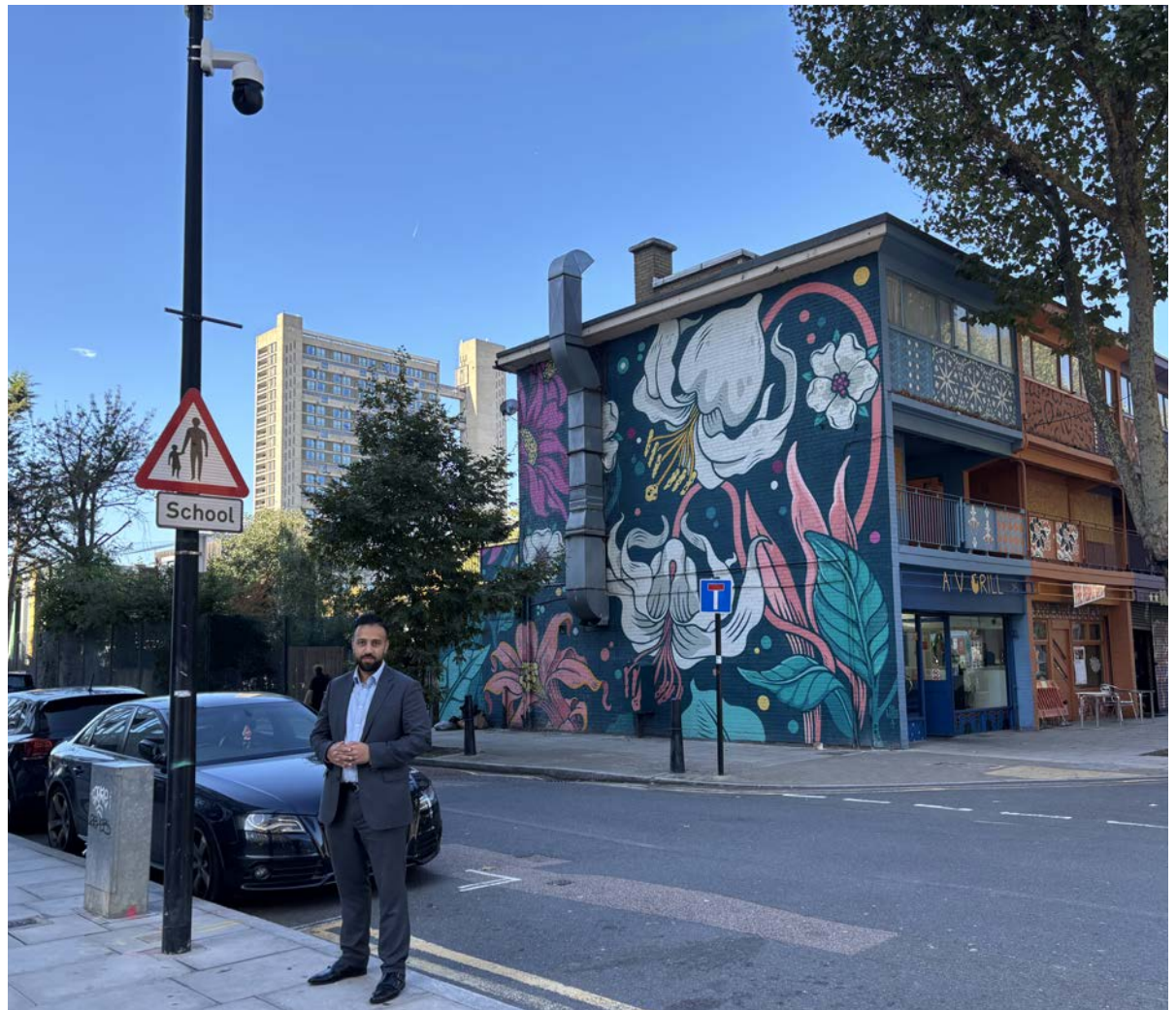
Cllr Abu Talha Chowdhury with one of the new cameras

A further 352 cameras are scheduled for inspection and upgrade.