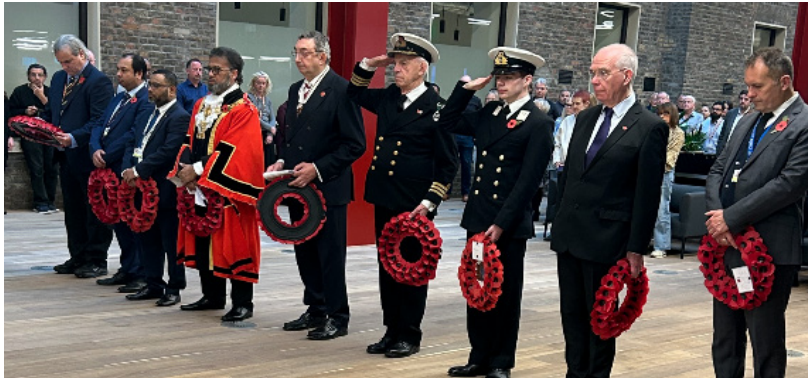
A two minute silence was held on Armistice Day at the Town Hall

Commemoration events were held across the borough on Remembrance Sunday 9 November and on Remembrance Day 11 November to honour the contribution of British and Commonwealth military and civilian servicemen and women involved in the two world wars and later conflicts.