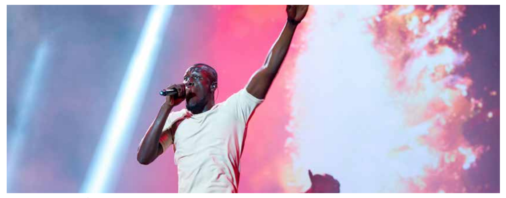
Stormzy is headlining the festival in a UK exclusive show