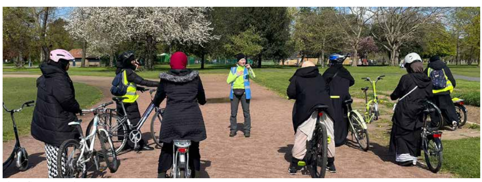
Give cycling a try with free weekly sessions in Victoria Park