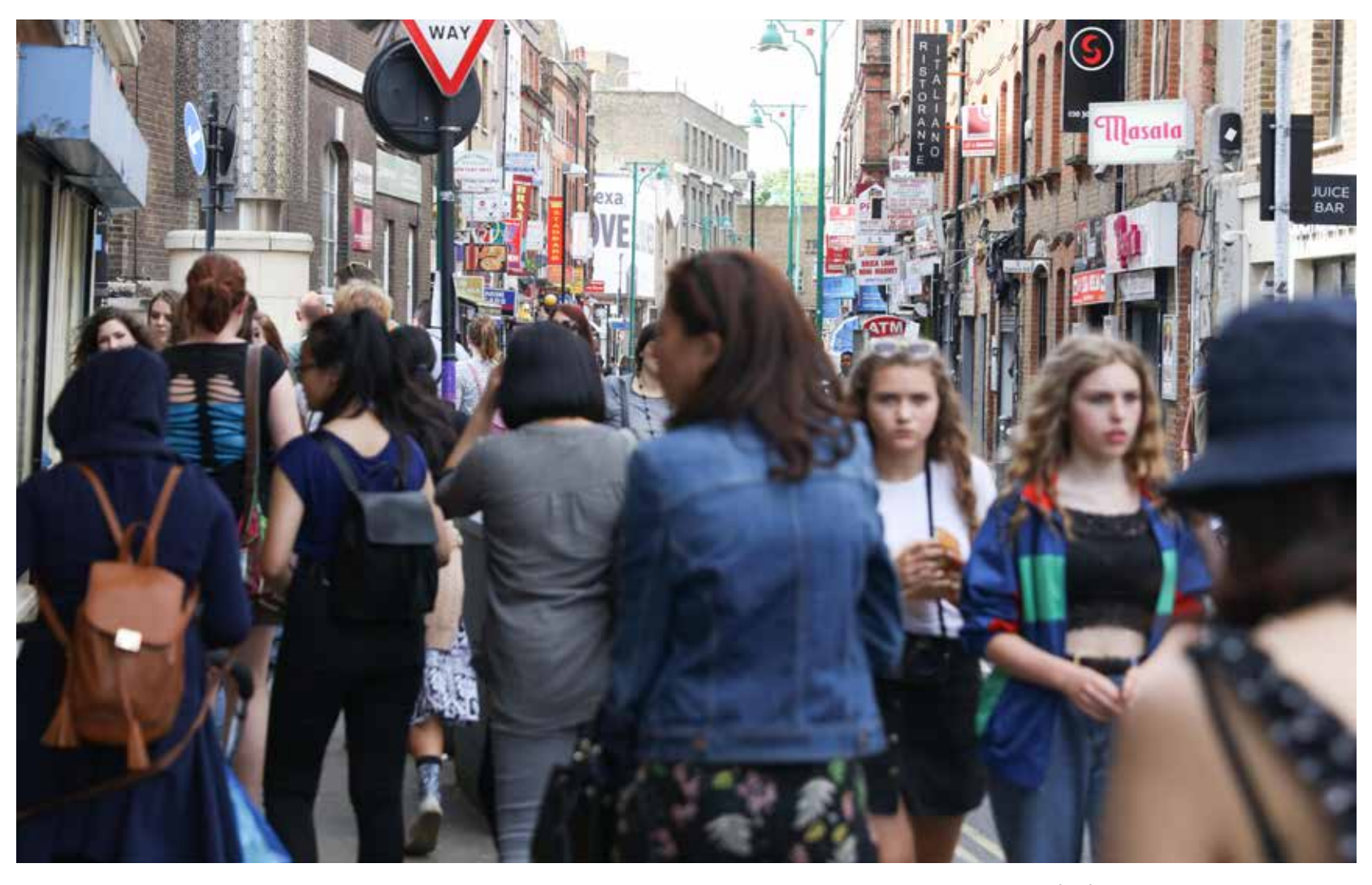
Results of the survey will test current research and help the council build up an idea of what improvements can be made for future developments.