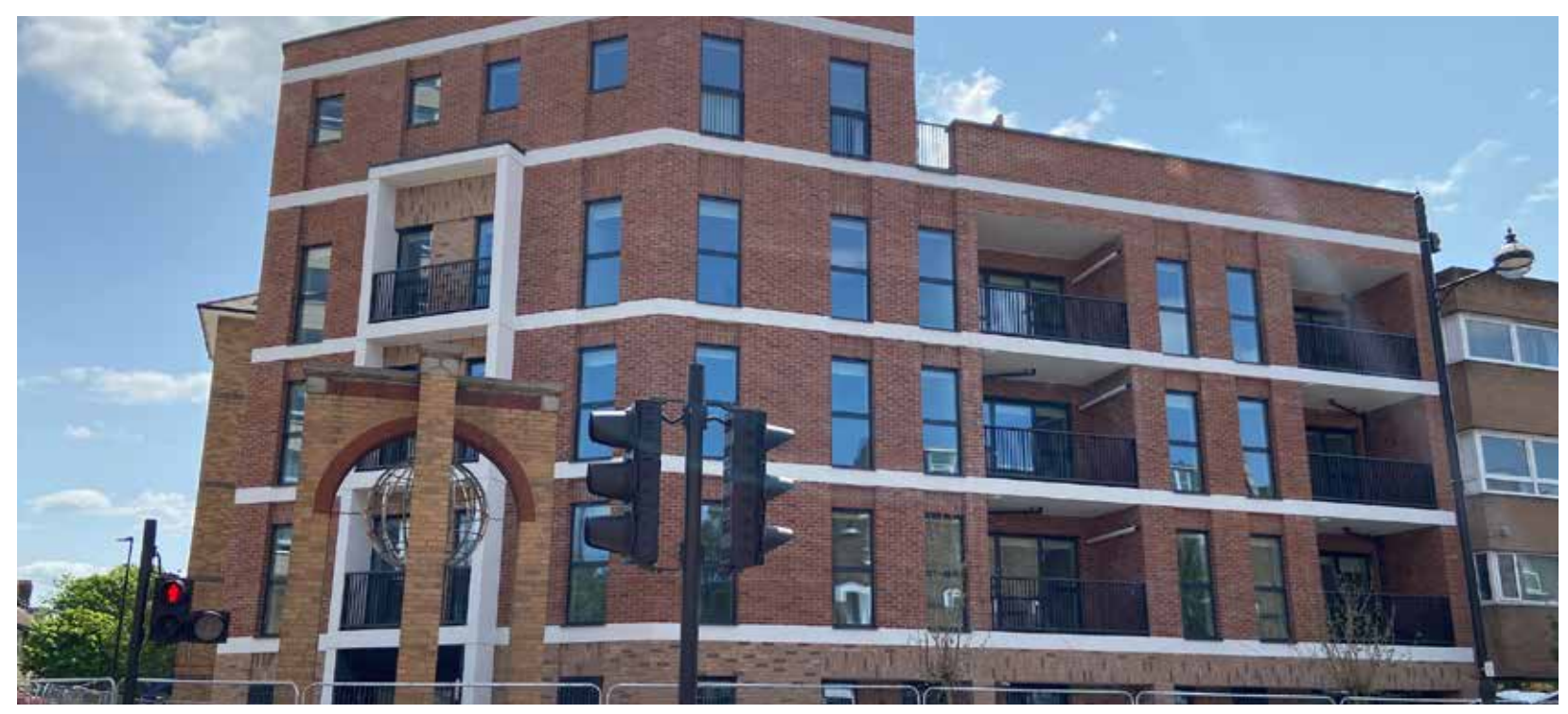
Sufia Kamal House, which is one of the new housing blocks nearing completion