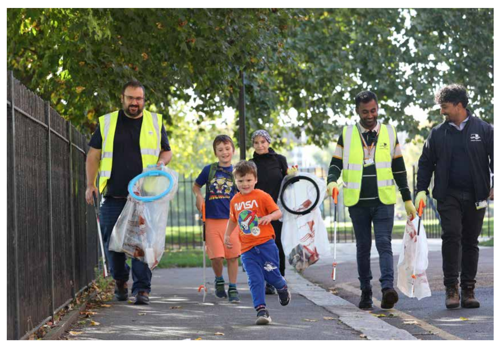
Residents and council staff taking part in a previous clear up in Bethnal Green

For more information about upcoming events visit www. towerhamlets.gov.uk/lgnl/ environment_and_waste/street_ care_and_cleaning/A_Cleaner_ Greener_borough.aspx