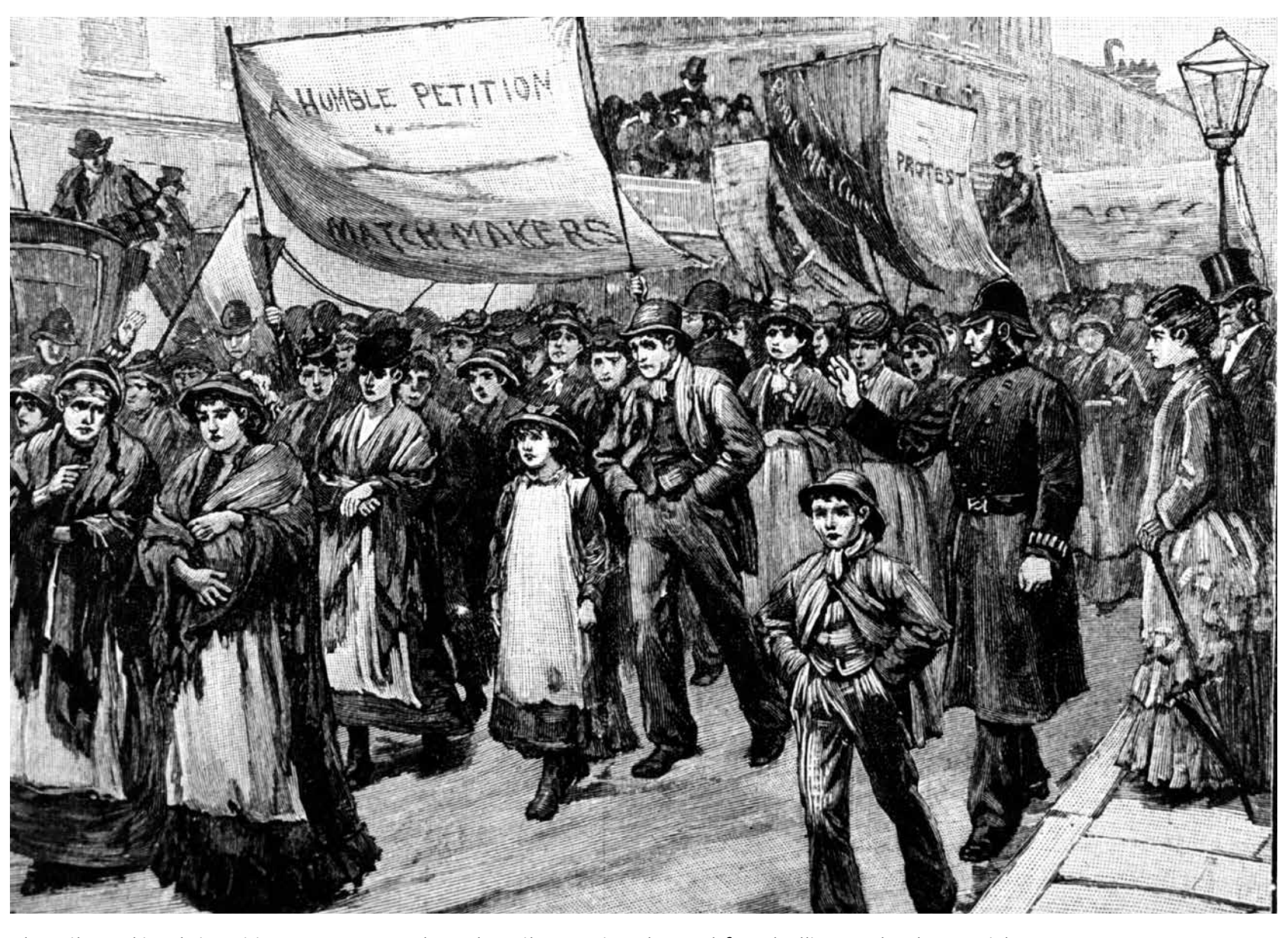
The strikers \ taking \ their \ petition \ to \ government, above, the \ strike \ committee, bottom \ left, and \ selling \ matches, bottom \ right