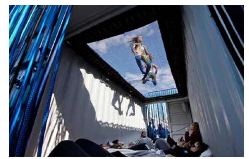
Bouncing Narratives will be performing on a trampoline

For more information and to view the full timetable of the festival's events, please visit festival.org/ GDIF-2023