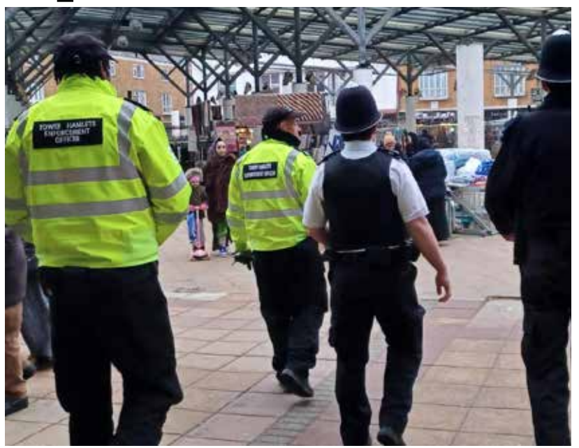
There have been 15 days of action under Operation Continuum

More than £137,000 in drug money has been seized, 6,600 stop and searches for drugs and weapons have been carried out, and 306 weapons have been seized during a joint police and council operation.