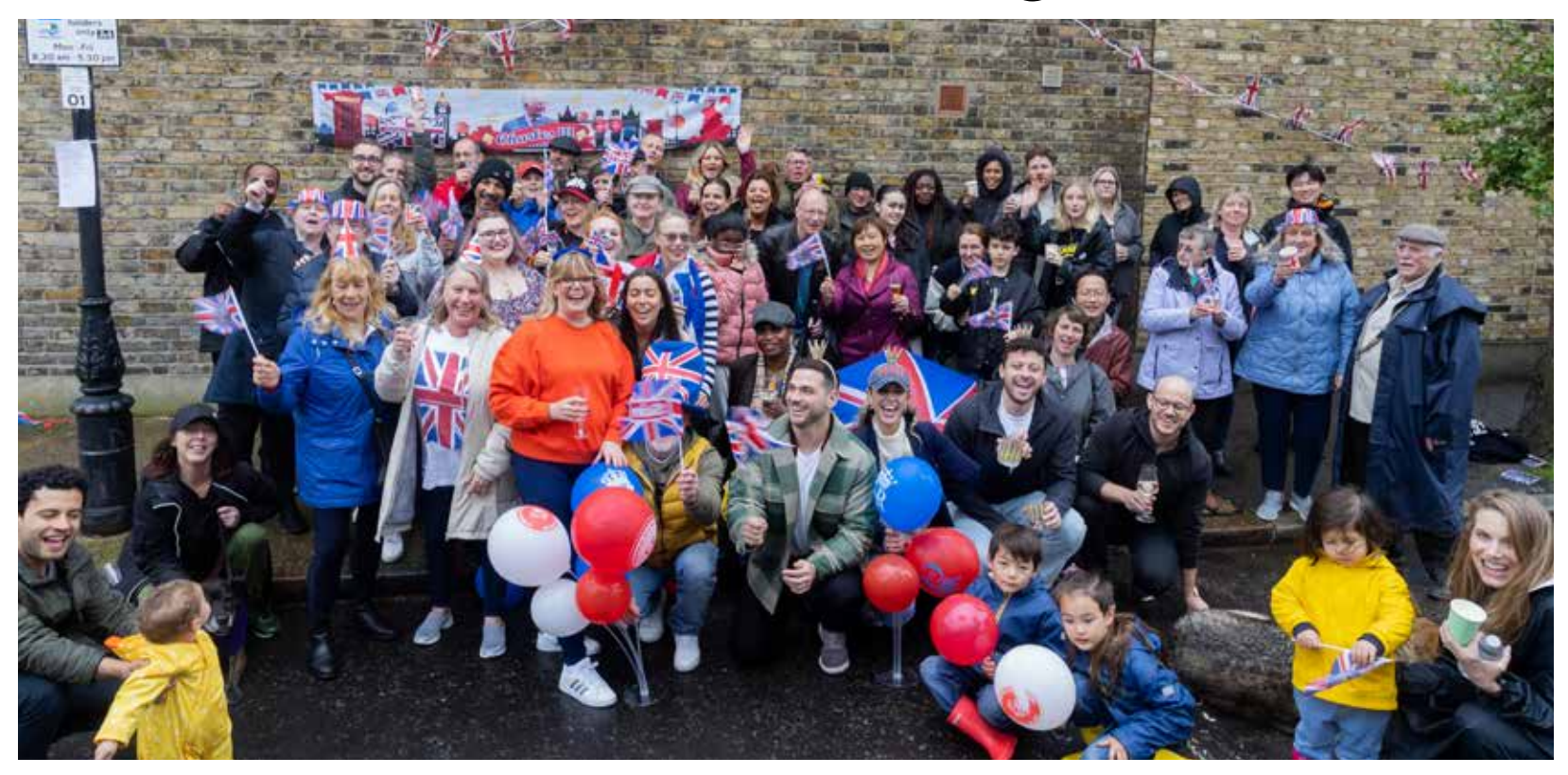
The street party in Cyprus Place to celebrate the coronation

Street parties and community events were in full swing across Tower Hamlets to mark the King's