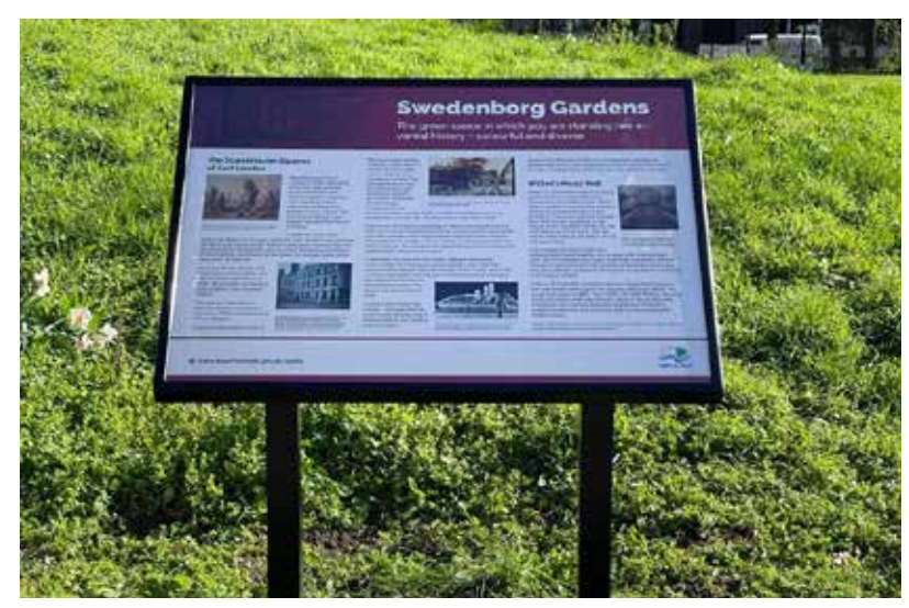
One of the new heritage panels which has been unveiled

Also coming soon is a new information panel in Grove Hall Park commemorating the matchwoman strike at the nearby Bryant & May Factory in 1888. Find out more about the strikes on p34 and 35.