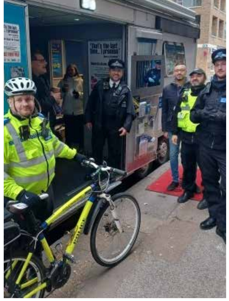
26 stolen bikes have been recovered during the operation

We appreciate the ongoing efforts of the ASB team in making this happen