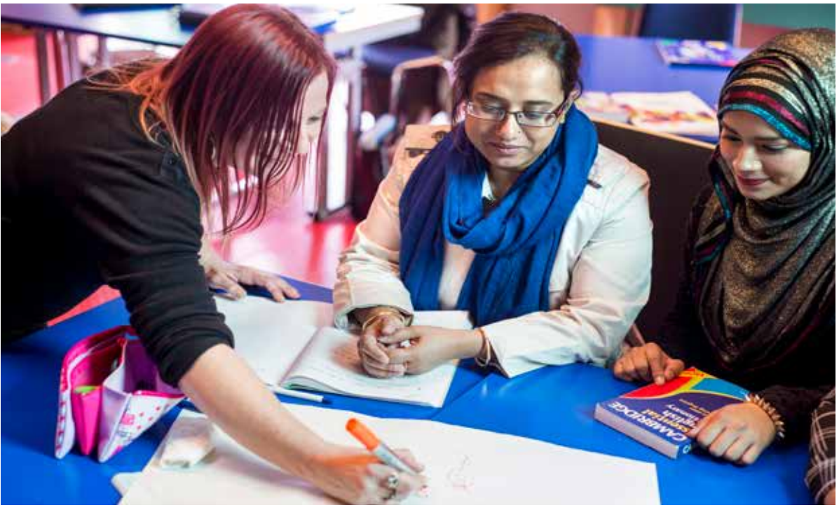
Courses include English and Maths, as well as community learning such as digital skills and languages

Tutors were shown to create positive and safe learning environments in which learners feel confident to take part in discussions and where they are treated with respect.