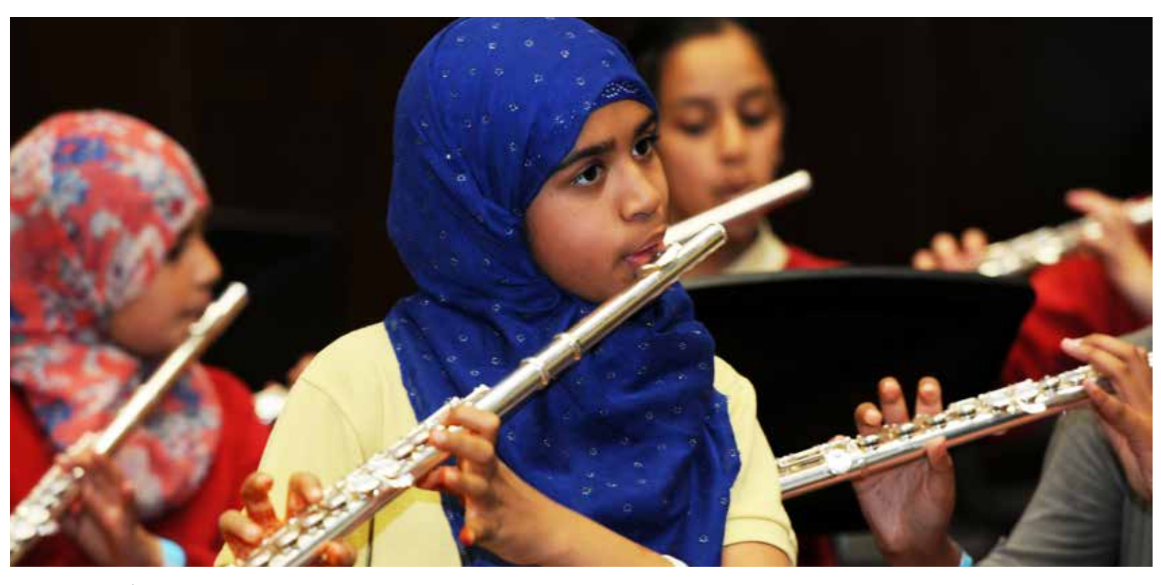
The money will fund two projects giving young people in Tower Hamlets more musical opportunities

A high-quality universal offer improves health and educational outcomes