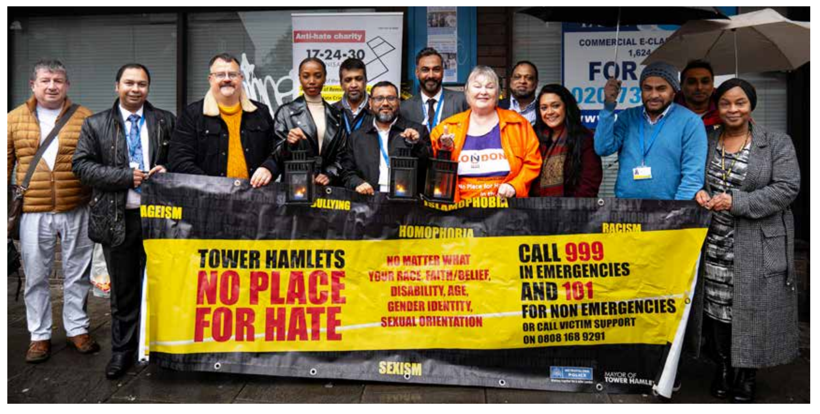
The three nail bombings in April 1999 killed three people and injured 140