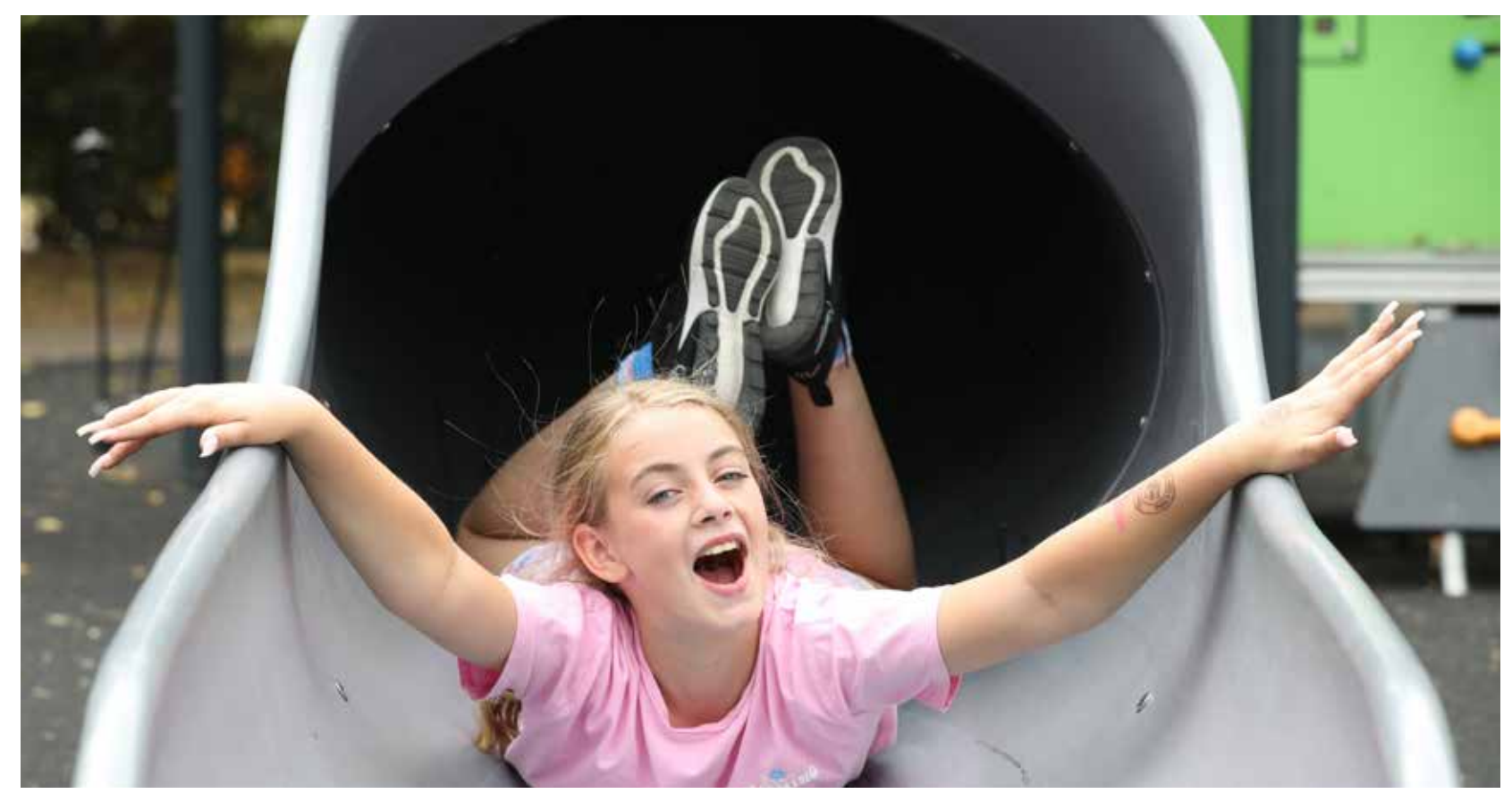
There will be activities for everyone this summer