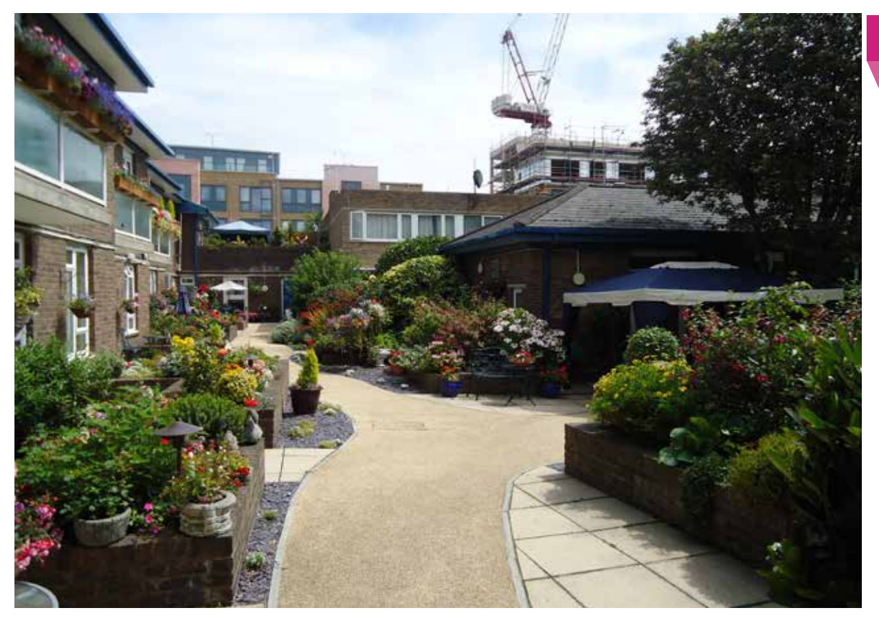
Lady Mico's garden which features as part of Tower Hamlets' Britain in Bloom entry