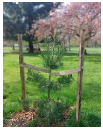
Since last year, Tower Hamlets Council has planted 3,000 trees

Tower Hamlets has been awarded 'Tree Cities of the World' status for the second year in a row for our greening work, including tree-planting, increasing biodiversity, and expanding and nurturing urban and community forestry.