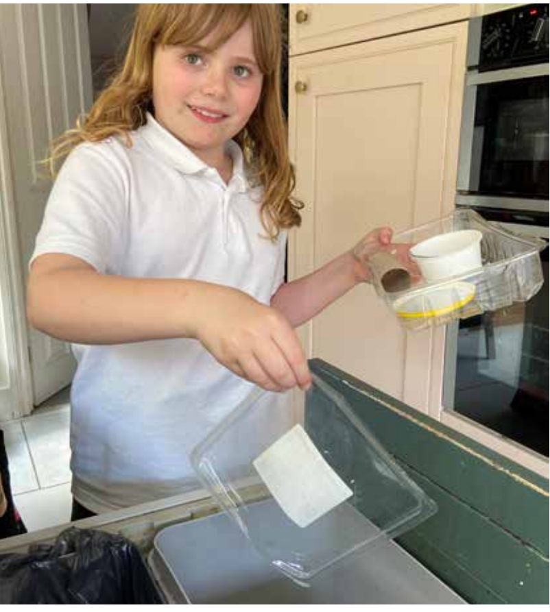
Recycling is beneficial to our planet, as demonstrated by a young resident

Visit our website for a full list of items that can and cannot be recycled on: www.towerhamlets. gov.uk/letsrethinkit