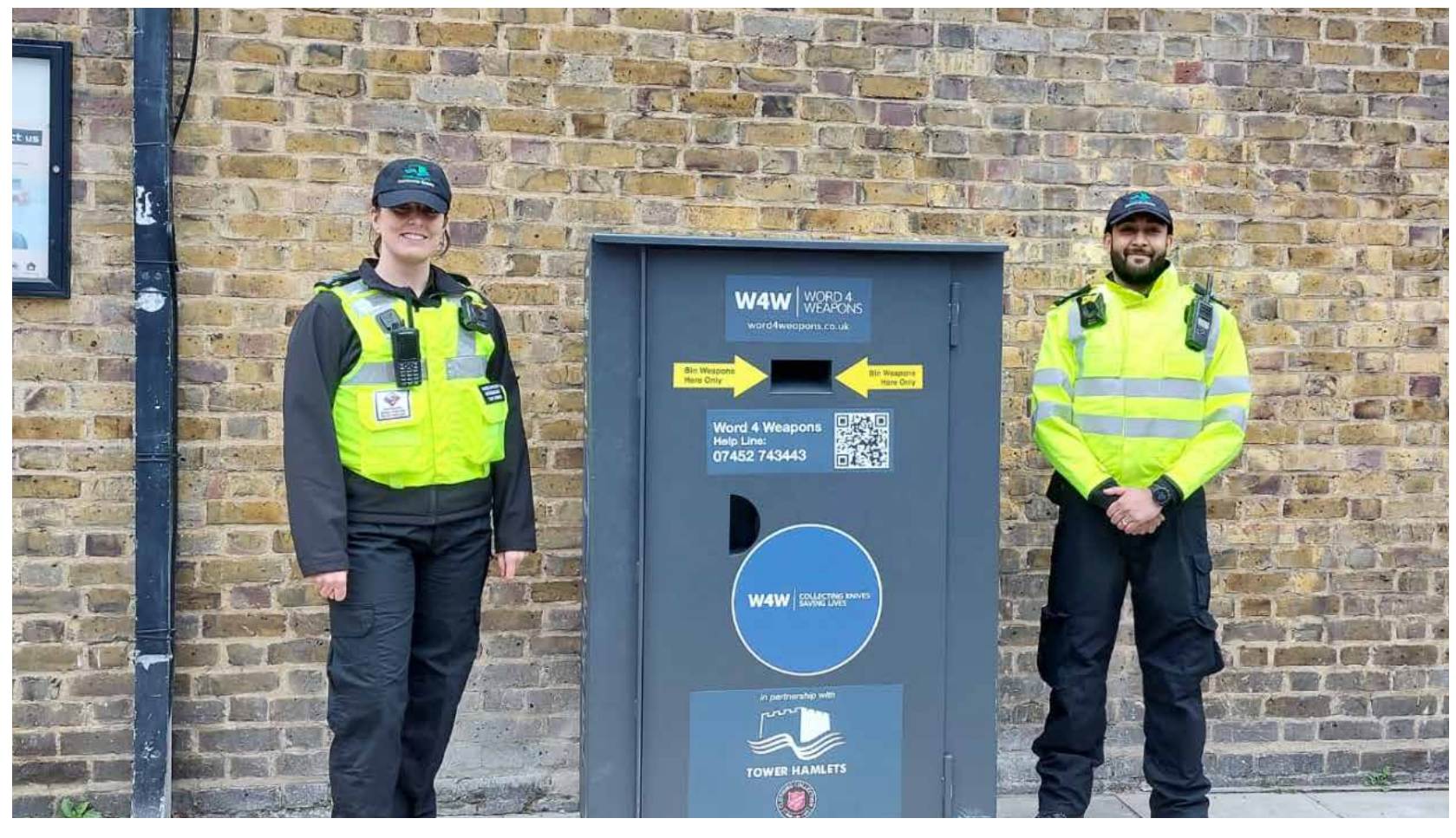
Two Tower Hamlets Enforcement Officers (THEOs) with one of the knife bins