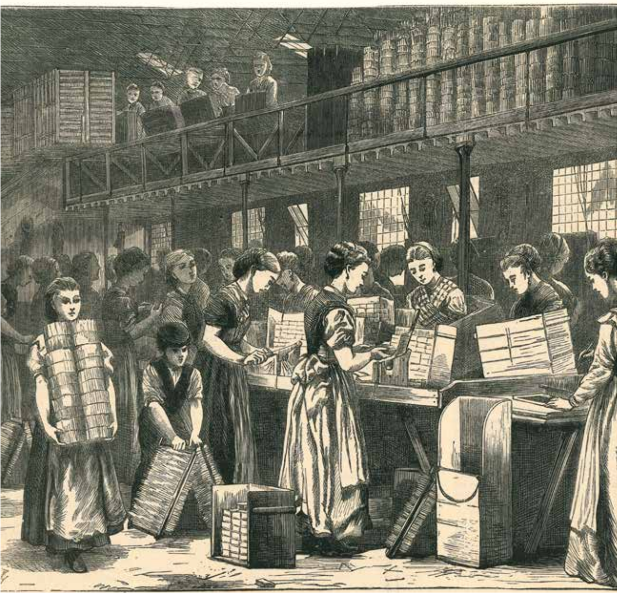
Workers in match factories were poorly paid and had to put up with dangerous conditions

were lower in 1888 than 1878. The women were actually malnourished.